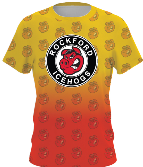
SU2. LOGO GRADIENT