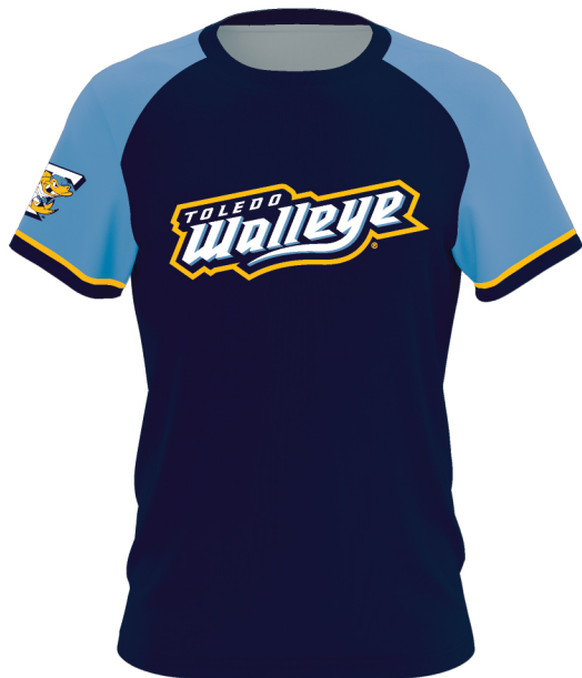
SUG. COLOR BLOCK