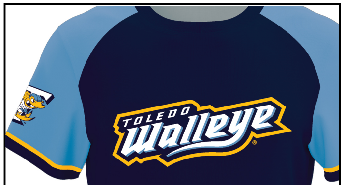
SU6. COLOR BLOCK