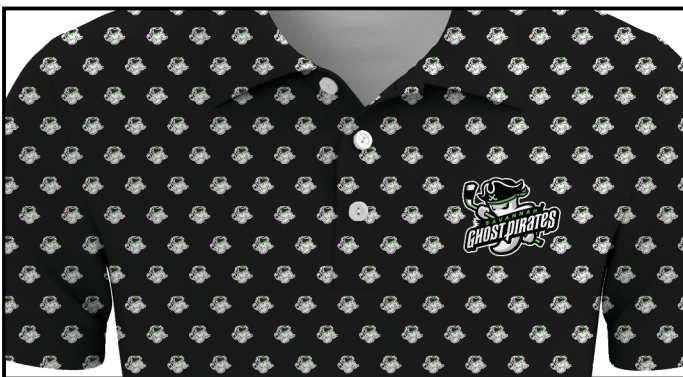
SU5. MICRO PATTERN