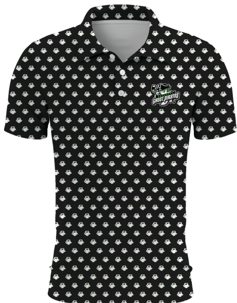
SU5. MICRO PATTERN