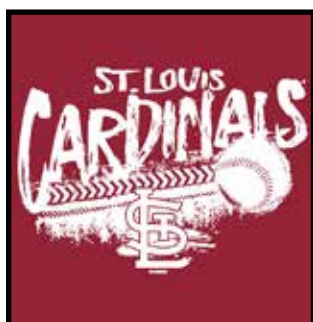
9. WHIP (VALUE PROGRAM)