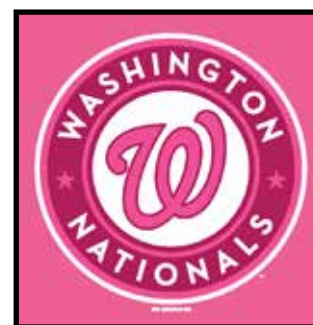
4. PRIMARY LOGO TONAL