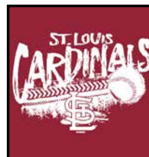
15. WHIP (VALUE PROGRAM)