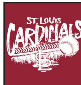
15. WHIP (VALUE PROGRAM)