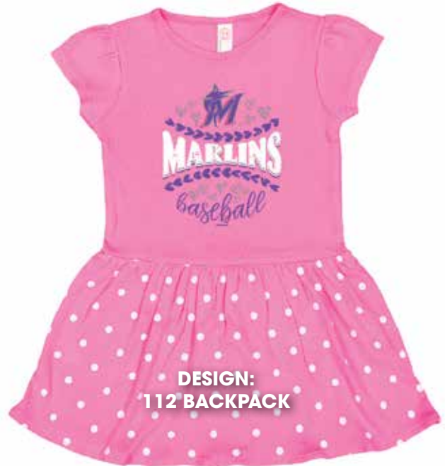
DESIGN: 112 BACKPACK

COLORS: Aqua, Black, Charcoal, Chill, Heather (90/10), Hot Pink, Lavender, Navy, Pink, Purple, Raspberry, Red, White, Yellow