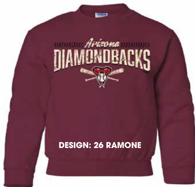
DESIGN: 26 RAMONE

COLORS: Grey Melange, Mauvelous Melange, Military Green Melange, Navy Melange, Purple Melange, Red Melange, Smoke Melange