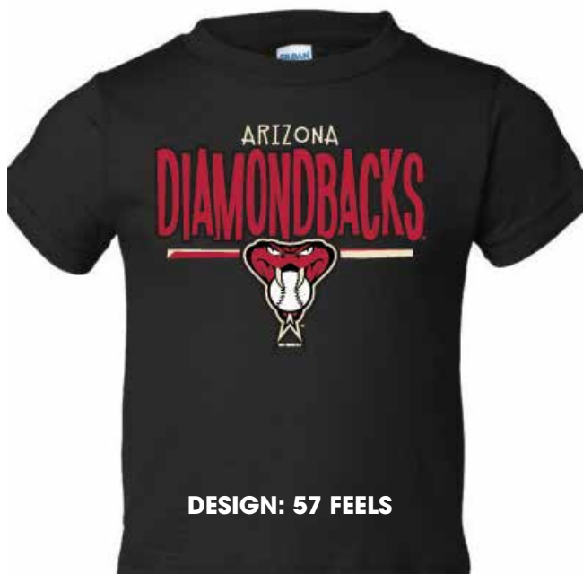
DESIGN: 57 FEELS

COLORS: Apple, Ash, Black, Carolina Blue, Charcoal, Cobalt, Forest, Garnet, Gold, Heather (90/10), Hot Pink, Kelly, Key Lime, Lavender, Lt. Blue, Maroon, Navy, Orange, Pink, Purple, Raspberry, Red, Royal, Texas Orange, Turquoise, White