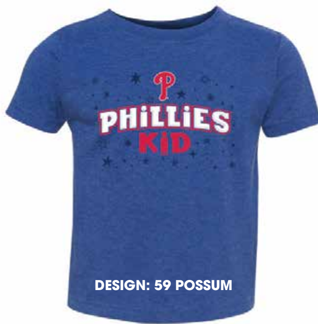
DESIGN: 59 POSSUM