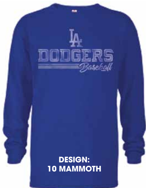
DESIGN: 10 MAMMOTH