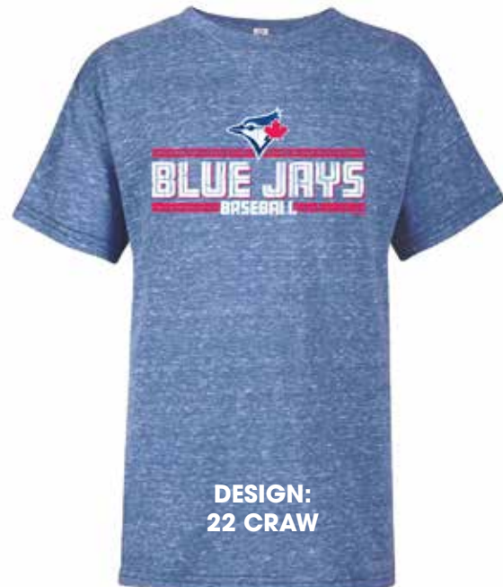
DESIGN: 22 CRAW