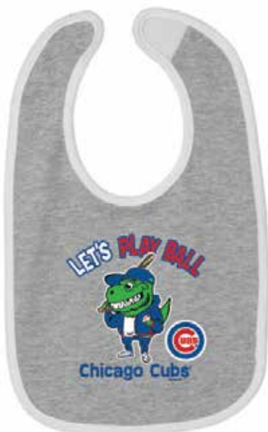
DESIGN: 75 DYNOMANIA