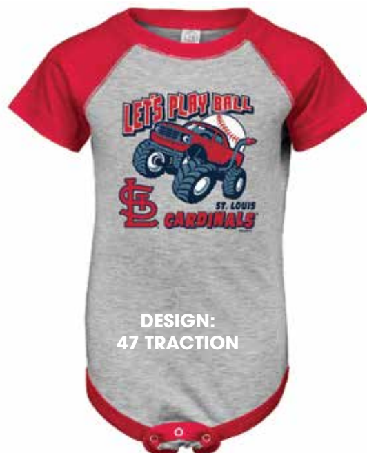
DESIGN: 47 TRACTION

COLORS: Granite Heather/Vintage Smoke, Red/White, Royal/White, Vintage Green/White, White/Black