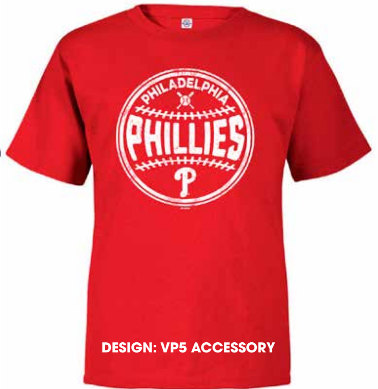
DESIGN: VP5 ACCESSORY