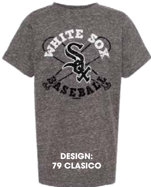
DESIGN: 79 CLASICO

COLORS: Black, Charcoal, Daisy, Dark Heather, Graphite Heather, Heather Cardinal, Heather Irish Green, Heather Navy, Heather Orange, Heather Purple, Heather Red, Heather Royal, Heather Sapphire, Heliconia, Lime, Navy, Red, Royal, Sapphire, Sport Grey, White