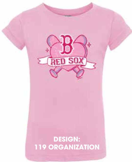
DESIGN: 119 ORGANIZATION