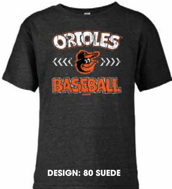
DESIGN: 80 SUEDE

COLORS: Athletic Heather, Athletic Navy, Black, Charcoal Heather, Coral Heather, Denim Heather, Kelly, Kelly Heather, Red, Red Heather, Royal, Royal Heather, Turquoise, Turquoise Heather, White