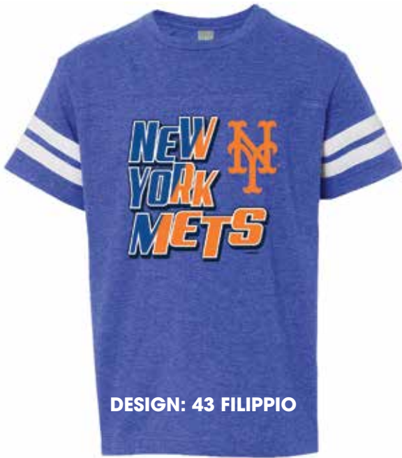
DESIGN: 43 FILIPPIO