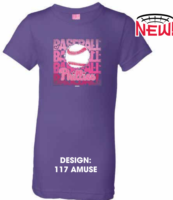
DESIGN: 117 AMUSE

COLORS: Neon Green, Neon Heather Orange, Neon Heather Pink, Neon Yellow