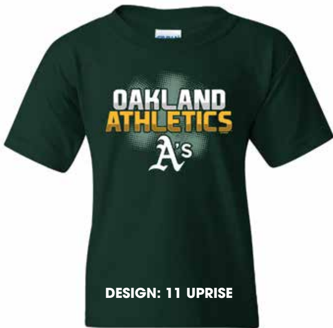
DESIGN: 11 UPRISE