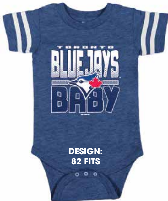
DESIGN: 82 FITS

COLORS: Caribbean Melange, Gray Melange, Green Melange, Mauvelous Melange, Military Green Melange, Navy Melange, Papaya Melange, Purple Melange, Red Melange, Royal Melange, Smoke Melange