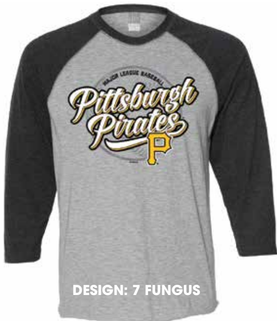
DESIGN: 7 FUNGUS

COLORS: Sport Grey/Black, Sport Grey/Navy, Sport Grey/Red, Sport Grey/Royal, White/Black, White/Navy, White/Red, White/Royal