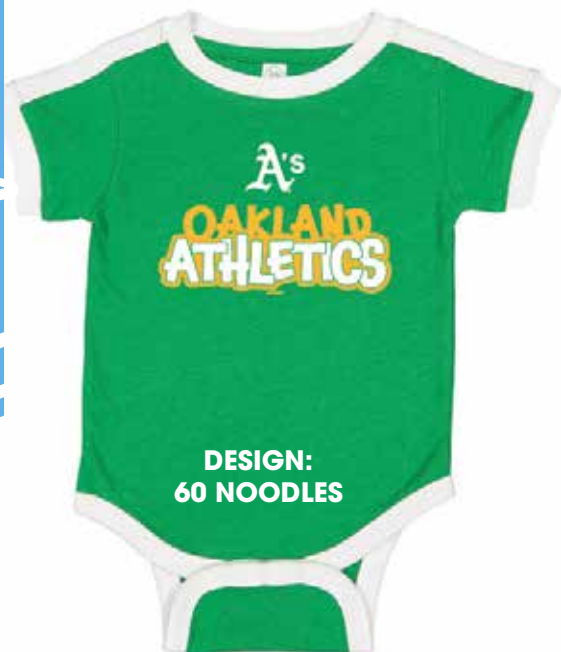
DESIGN: 60 NOODLES