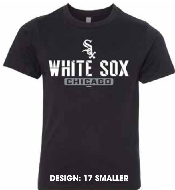
DESIGN: 17 SMALLER