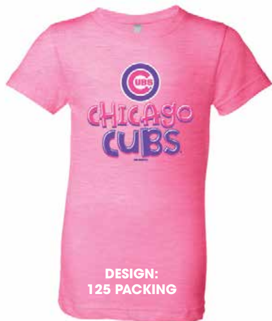
DESIGN: 125 PACKING

COLORS: Black, Heather Grey (90/10), Hot Pink, Lilac, Lt. Pink, Midnight Navy, Purple Rush, Raspberry, Red, Tahiti Blue, Turquoise, White