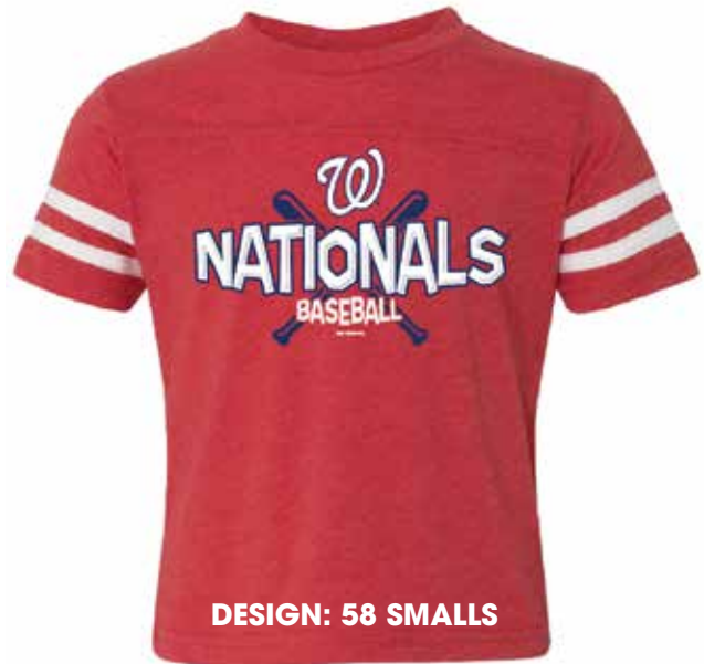
DESIGN: 58 SMALLS