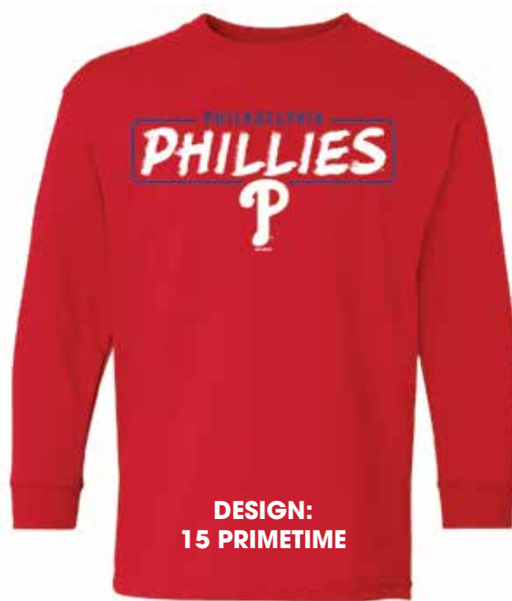
DESIGN: 15 PRIMETIME

COLORS: Athletic Heather, Athletic Navy, Black, Charcoal Heather, Denim Heather, Kelly, Kelly Heather, Red, Red Heather, Royal, Royal Heather, White