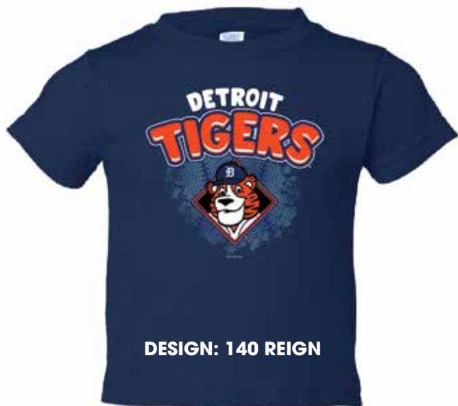
DESIGN: 140 REIGN

COLORS: Ash, Azalea, Black, Cherry Blossom, Forest Green, Garnet, Gold, Lt. Blue, Maroon, Navy, Orange, Oxford, Pink, Purple, Red, Royal, White