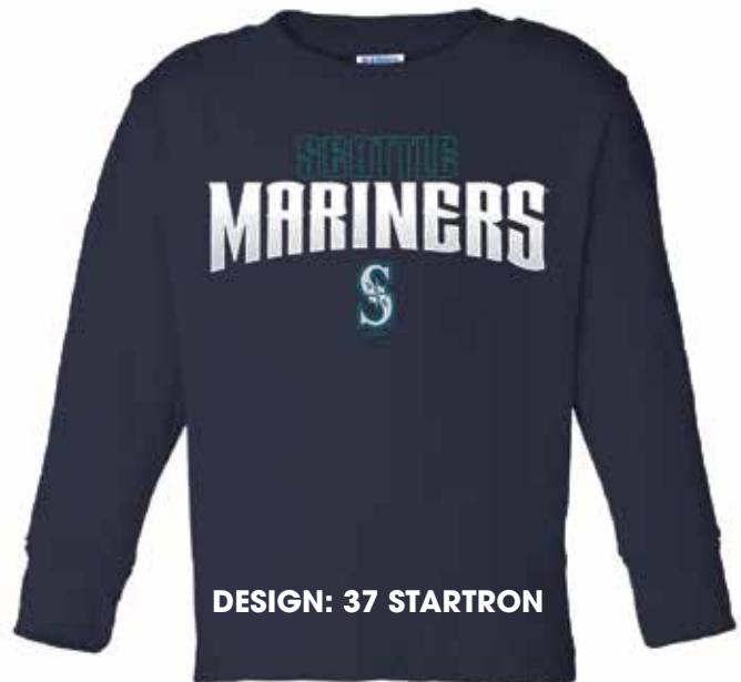
DESIGN: 37 STARTRON