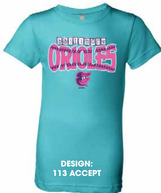
DESIGN: 113 ACCEPT