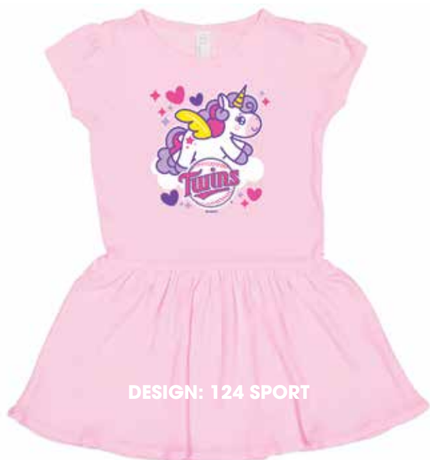
DESIGN: 124 SPORT