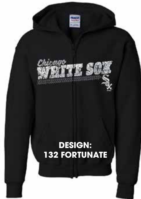
DESIGN: 132 FORTUNATE

COLORS: Black, Charcoal, Heather Grey, Navy, Pink, Purple, Red, Royal