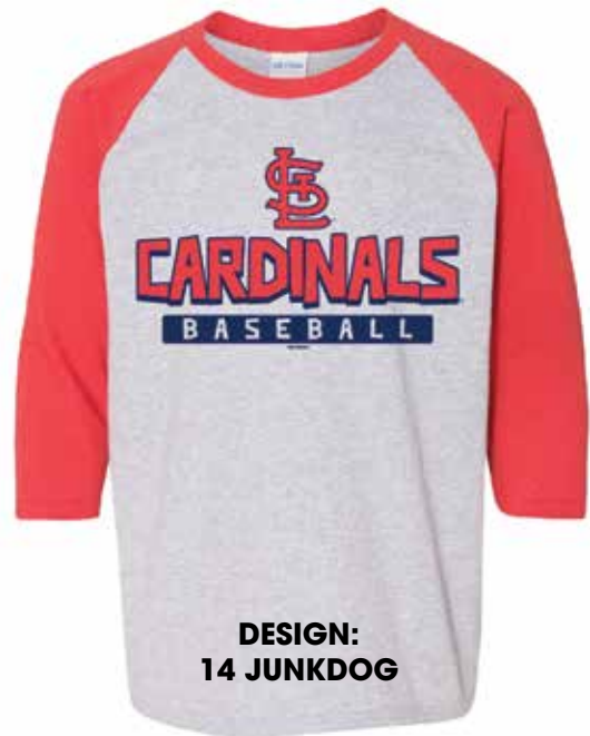
DESIGN: 14 JUNKDOG

COLORS: Vintage Burgundy, Vintage Green, Vintage Heather, Vintage Hot Pink, Vintage Navy, Vintage Orange, Vintage Purple, Vintage Red, Vintage Royal, Vintage Smoke with Blended White stripes