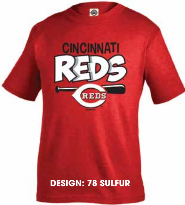
DESIGN: 78 SULFUR