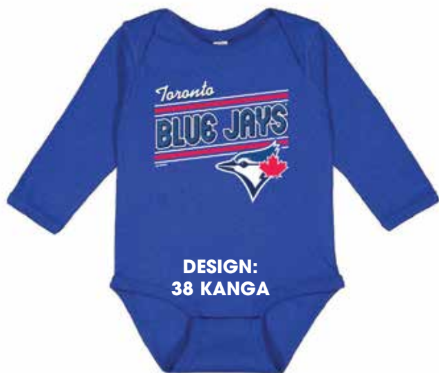
DESIGN: 38 KANGA

COLORS: Carolina Blue/Vintage Heather, Heather/Burgundy, Heather/Hot Pink, Heather/Navy, Heather/Purple, Heather/Red, Heather/Royal, Heather/Smoke, Pink/Vintage Heather, Vintage Heather/Vintage Orange, Vintage Smoke/Granite Heather, White/Vintage Heather