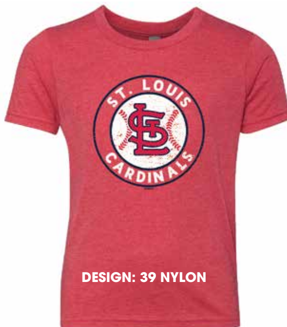
DESIGN: 39 NYLON

COLORS: Vintage Burgundy, Vintage Green, Vintage Hot Pink, Vintage Navy, Vintage Orange, Vintage Purple, Vintage Red, Vintage Royal, Vintage Smoke, Vintage Turquoise