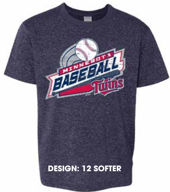
DESIGN: 12 SOFTER