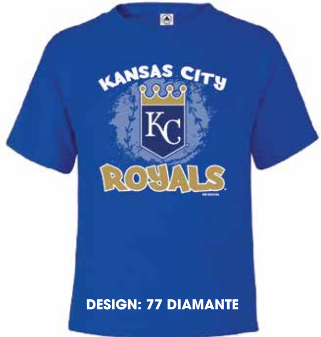
DESIGN: 77 DIAMANTE

COLORS: Athletic Heather, Berry, Black, Charcoal, Charcoal Heather, Deep Coral, Denim Heather, Graphite Heather, Heliconia Heather, Kelly, Kelly Heather, Lavender, Navy, Orange, Purple, Purple Heather, Red, Red Heather, Royal, Royal Heather, Safety Green, Safety Orange, Safety Pink, Sky Blue, Turquoise, Turquoise Heather, White