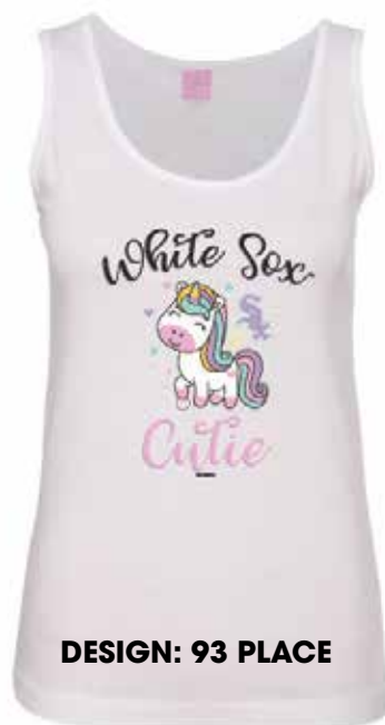
DESIGN: 93 PLACE