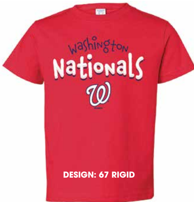
DESIGN: 67 RIGID