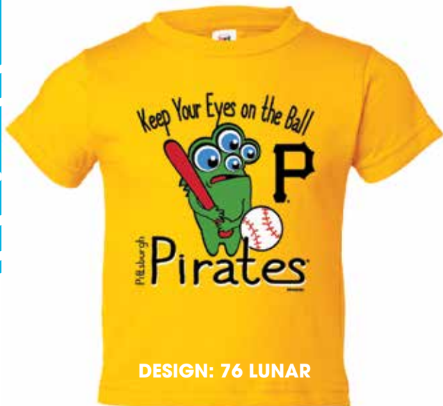
DESIGN: 76 LUNAR