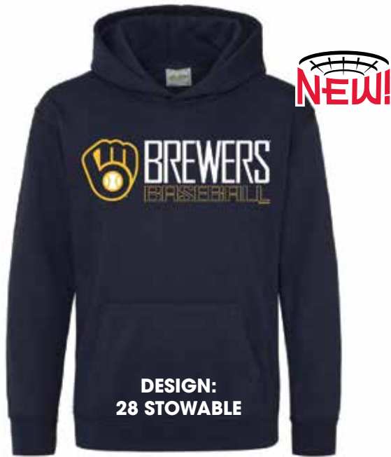
DESIGN: 28 STOWABLE