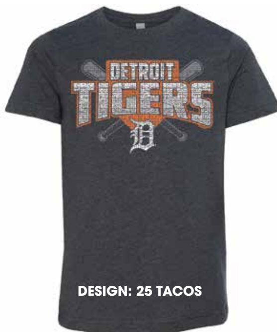
DESIGN: 25 TACOS

COLORS: Black, Charcoal, Dark Heather Grey, Kelly Green, Midnight Navy, Orange, Purple Rush, Red, Royal Blue, Tahiti Blue, Turquoise, White