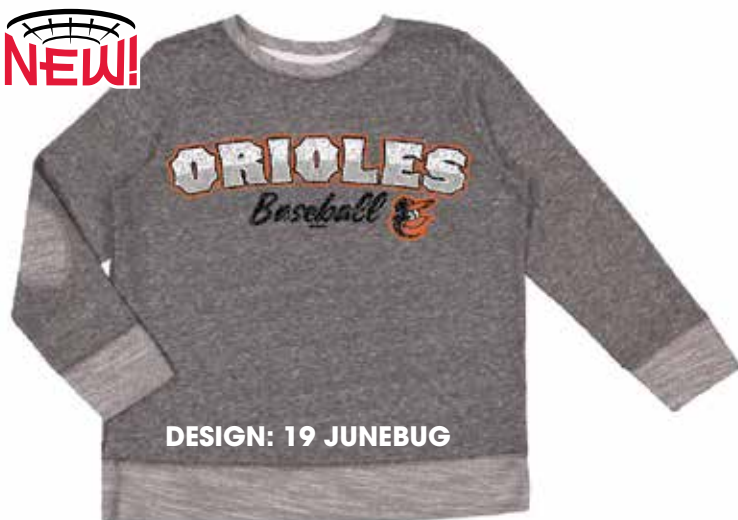
DESIGN: 19 JUNEBUG