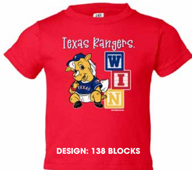
DESIGN: 138 BLOCKS

COLORS: Granite Heather/Black (60/40), Heather/White (90/10), Kelly/Red, Lavender/Purple, Navy/Red, Orange/Black, Pink/Red, White/Black, White/Lt. Blue, White/Navy, White/Pink, White/Red, White/Royal