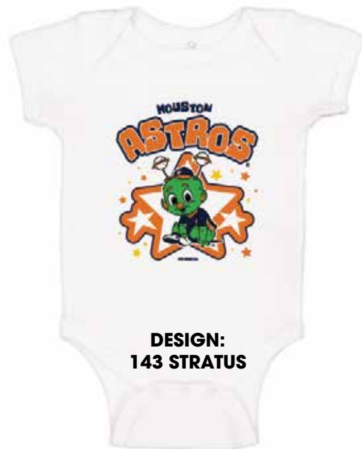
DESIGN: 143 STRATUS

COLORS: Ash, Black, Carolina Blue, Charcoal, Forest, Gold, Heather (90/10), Hot Pink, Kelly, Key Lime, Lavender, Lt. Blue, Maroon, Navy, Orange, Pink, Purple, Raspberry, Red, Royal, White