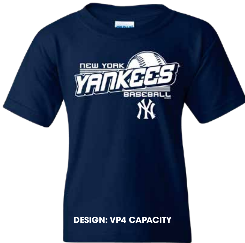
DESIGN: VP4 CAPACITY