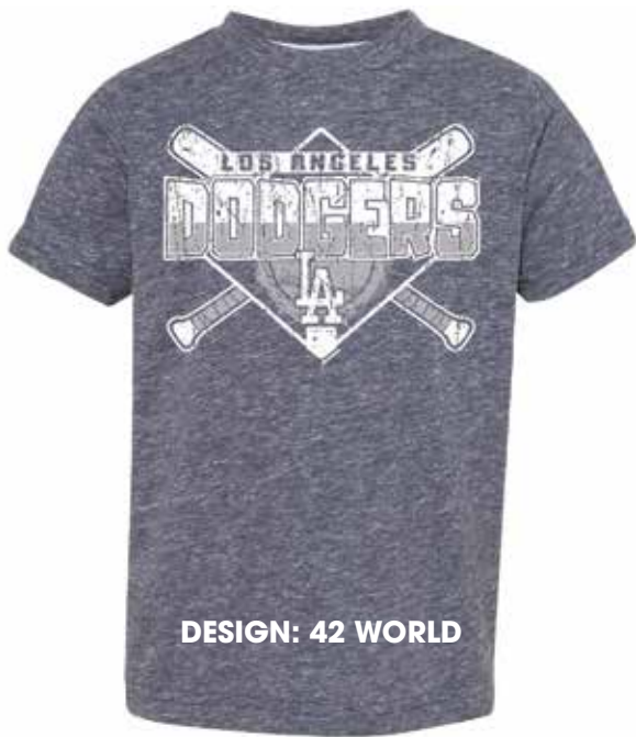
DESIGN: 42 WORLD