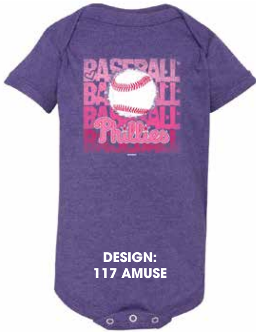
DESIGN: 117 AMUSE