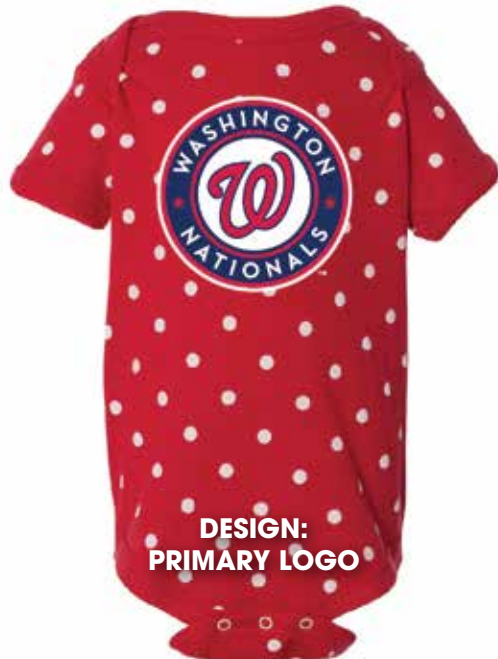
DESIGN: PRIMARY LOGO

COLORS: Ballerina/Mauvelous, Black/White, Lavender/Purple, Navy/Red, White/Titanium