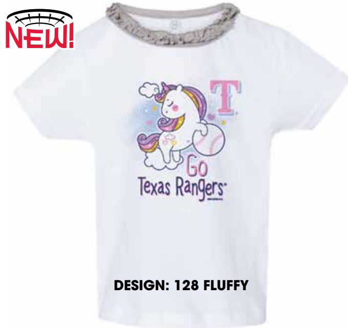
DESIGN: 128 FLUFFY