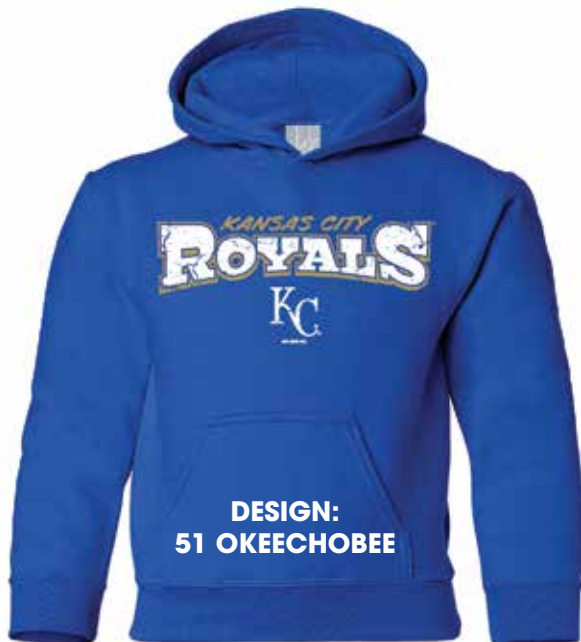
DESIGN: 51 OKEECHOBEE

COLORS: Black, Navy, Red, Royal, Sport Grey