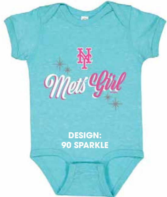
DESIGN: 90 SPARKLE

COLORS: Vintage Burgundy, Vintage Green, Vintage Hot Pink, Vintage Navy, Vintage Orange, Vintage Purple, Vintage Red, Vintage Royal, Vintage Smoke, Vintage Turquoise