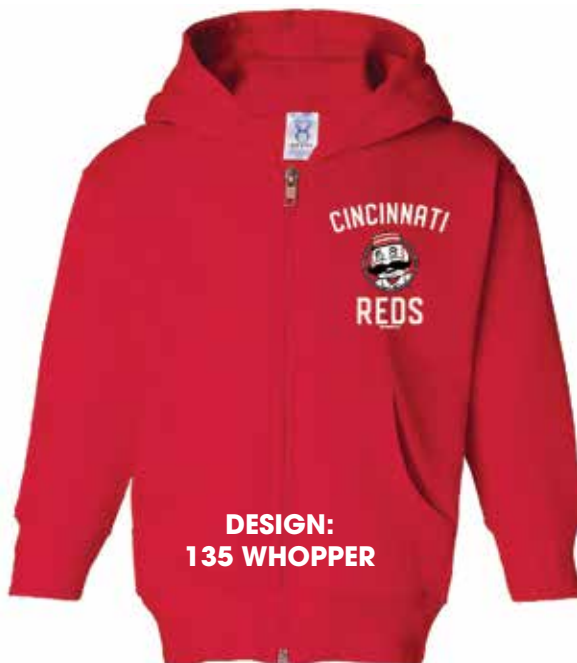
DESIGN: 135 WHOPPER

COLORS: Black, Heather, Hot Pink, Kelly, Light Blue, Navy, Pink, Raspberry, Red, Royal, White