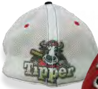
White Mesh Only