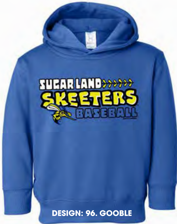
DESIGN: 96. GOOBLE