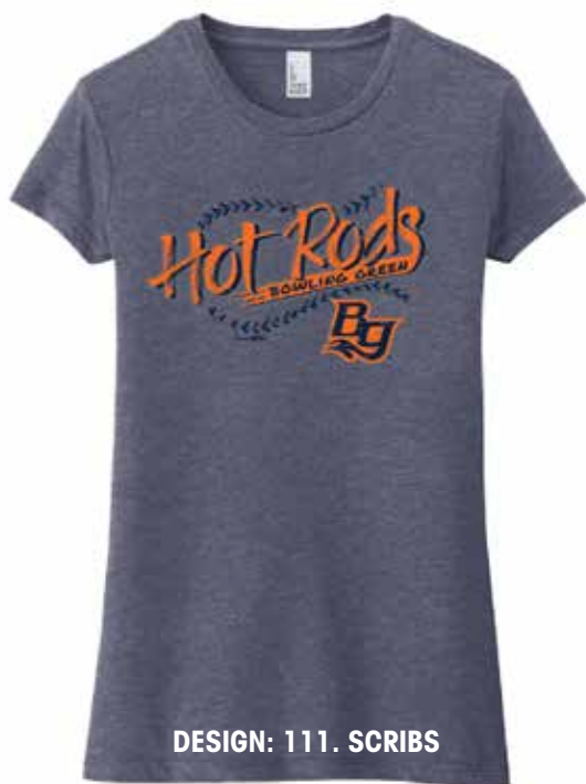
DESIGN: 111. SCRIBS