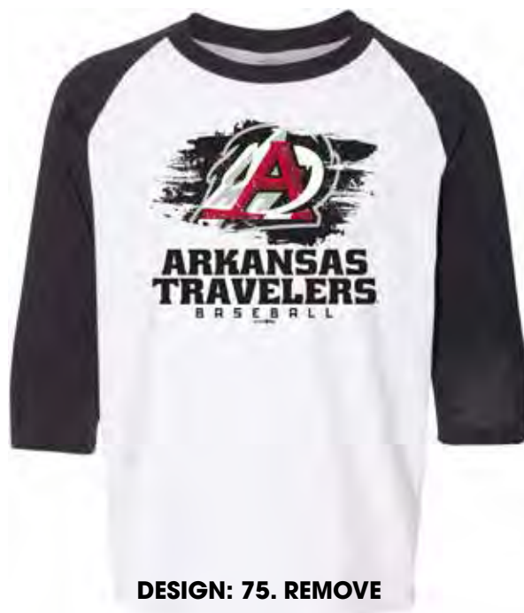
DESIGN: 75. REMOVE

COLORS: Vintage Burgundy, Vintage Green, Vintage Heather, Vintage Hot Pink, Vintage Navy, Vintage Orange, Vintage Purple, Vintage Red, Vintage Royal, Vintage Smoke with Blended White stripes