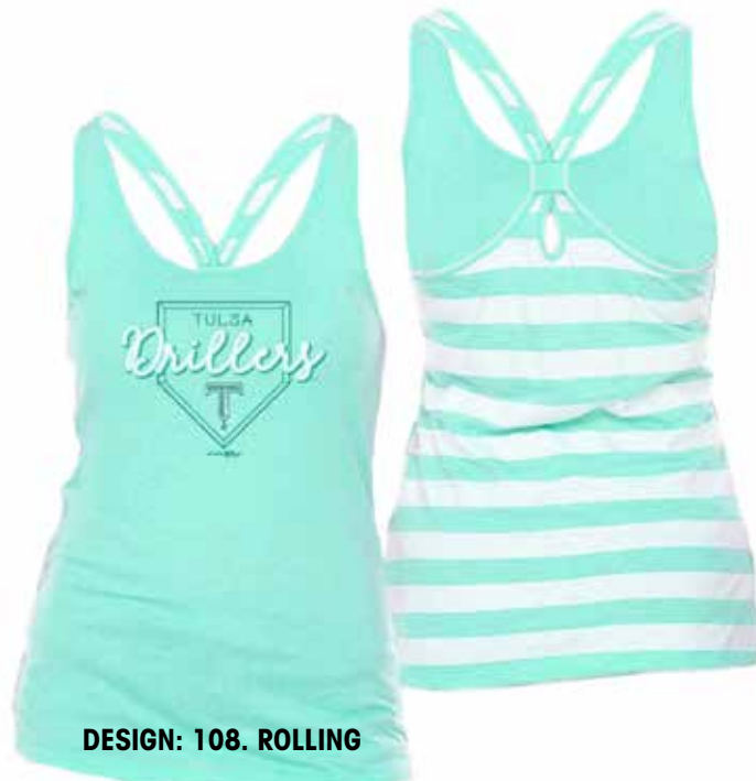
DESIGN: 108. ROLLING

COLORS: Black, Black Frost, Grey Frost, Heathered Charcoal, Navy Frost, Red Frost, Royal Frost, Turquoise Frost, White