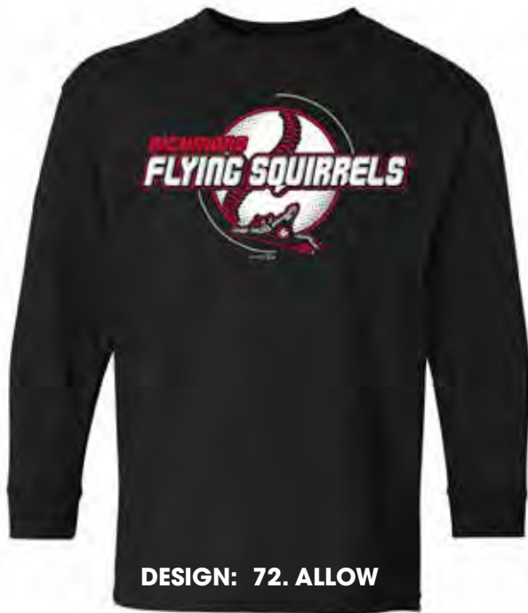
DESIGN: 72. ALLOW

DESCRIPTION: 5.3 oz., 100% Cotton, preshrunk. Seamless double needle 3/4" collar, taped neck and shoulders, rib cuffs, double needle bottom hem, quarter-turned to eliminate center crease.