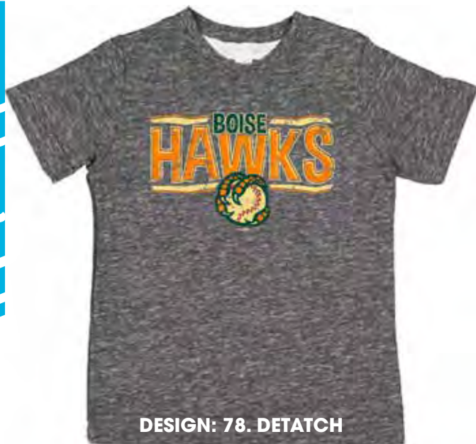
DESIGN: 78. DETATCH