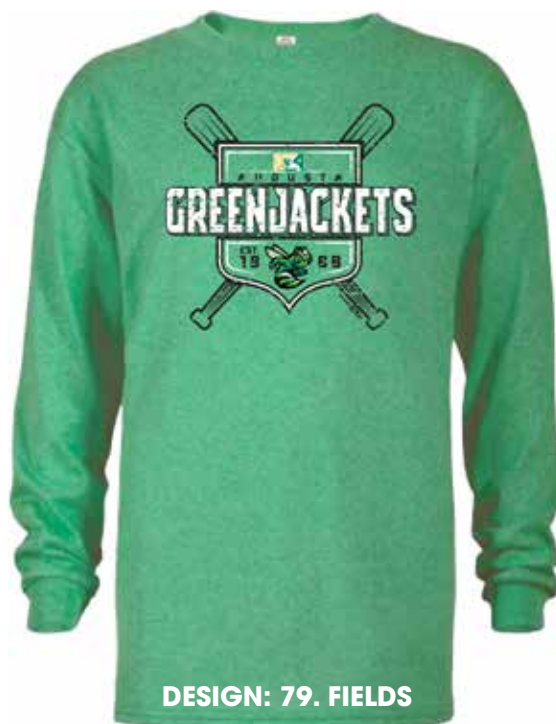
DESIGN: 79. FIELDS

COLORS: Carolina Blue/Vintage Heather, Pink/Vintage Heather, Vintage Heather/Vintage Burgundy, Vintage Heather/Vintage Hot Pink, Vintage Heather/Vintage Navy, Vintage Heather/Vintage Orange, Vintage Heather/Vintage Purple, Vintage Heather/Vintage Red, Vintage Heather/Vintage Royal, Vintage Heather/Vintage Smoke, Vintage Smoke/Granite Heather, White/Vintage Heather