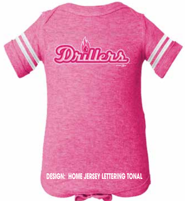
DESIGN: HOME JERSEY LETTERING TONAL

COLORS: Caribbean Melange, Gray Melange, Mauvelous Melange, Military Green Melange, Navy Melange, Papaya Melange, Purple Melange, Red Melange, Royal Melange, Smoke Melange