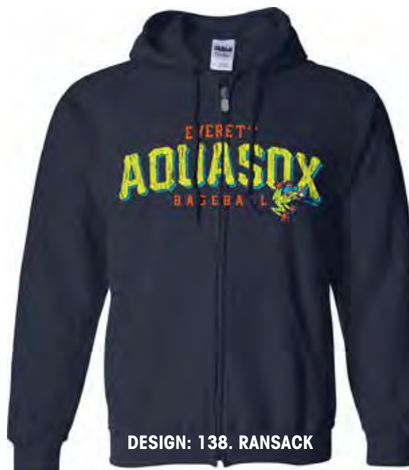
DESIGN: 138. RANSACK