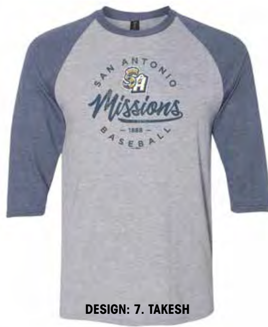
DESIGN: 7. TAKESH

COLORS: Vintage Heather body with: Vintage Burgundy, Vintage Hot Pink, Vintage Navy, Vintage Orange, Vintage Purple, Vintage Red, Vintage Royal, Vintage Smoke sleeves. Carolina Blue/Vintage Heather, Pink/Vintage Heather, Vintage Smoke/Granite Heather, White/Vintage Heather