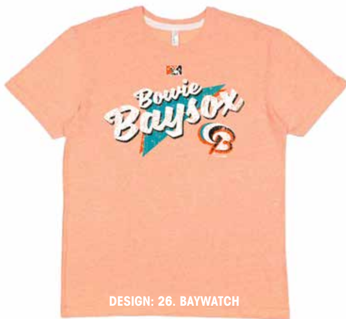
DESIGN: 26. BAYWATCH

PRICING 48 $9.65 72+ $8.90 2XL: Add $1.00 3XL: Add $2.00