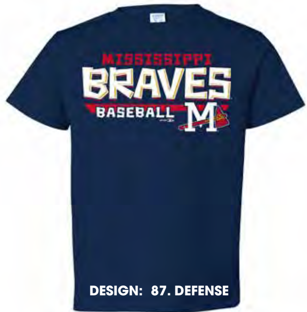
DESIGN: 87. DEFENSE

COLORS: Ash, Aqua, Azalea, Black, Cherry Blossom, Forest, Garnet, Gold, Lt. Blue, Maroon, Navy, Orange, Oxford, Pink, Purple, Red, Royal, Shamrock, White