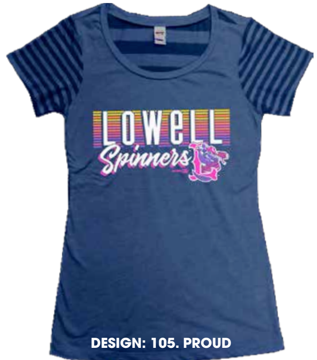
DESIGN: 105. PROUD

COLORS: Dark H. Gray/Black, Dark H. Gray/Cardinal, Dark H. Gray/Cobalt, Dark H. Gray/Red, Dark H. Gray/Watermelon, White/Red