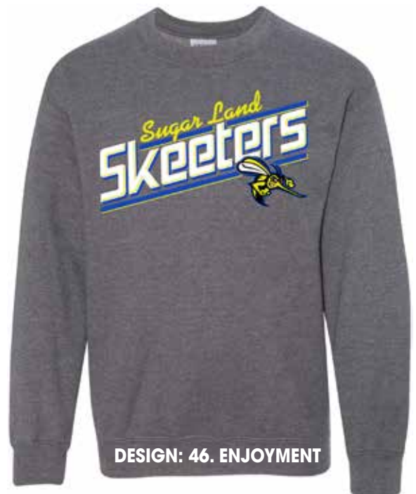
DESIGN: 46. ENJOYMENT

COLORS: Black, Carolina Blue, Forest Green, Gold, Irish Green, Navy, Purple, Red, Royal, Sport Grey, White