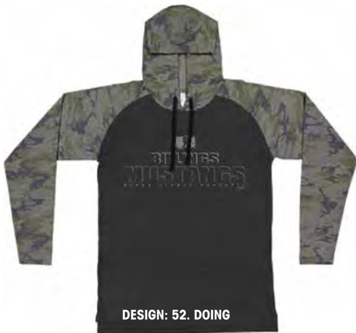
DESIGN: 52. DOING

COLORS: Black, Columbia Blue, Forest, Gold, Graphite, Kelly, Lime, Maroon, Navy, Pink, Purple, Red, Royal, Silver, Vegas Gold, White