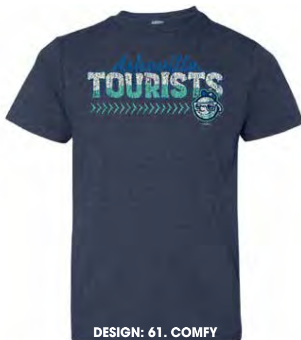
DESIGN: 61. COMFY