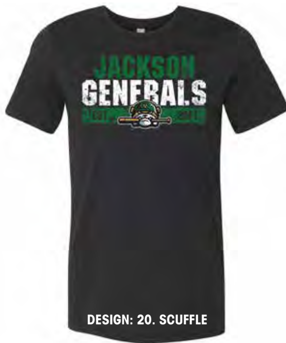
DESIGN: 20. SCUFFLE

COLORS: Berry Snow Heather, Black Snow Heather, Denim Snow Heather, Graphite Snow Heather, Kelly Snow Heather, Purple Snow Heather, Red Snow Heather, Royal Snow Heather, Turquoise Snow Heather