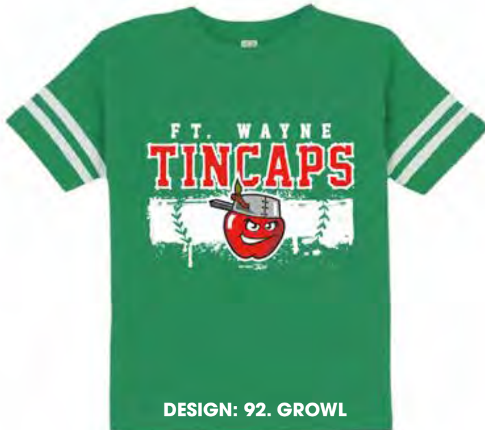
DESIGN: 92. GROWL

COLORS: Caribbean Melange, Gray Melange, Mauvelous Melange, Military Green Melange, Navy Melange, Papaya Melange, Purple Melange, Red Melange, Royal Melange, Smoke Melange