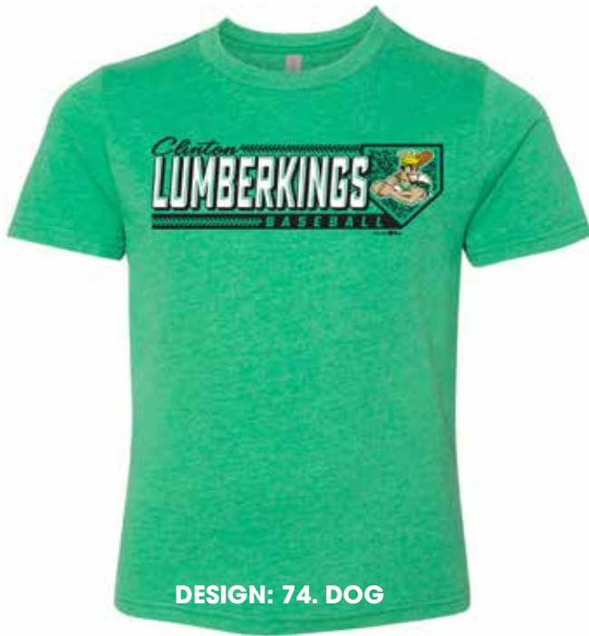
DESIGN: 74. DOG