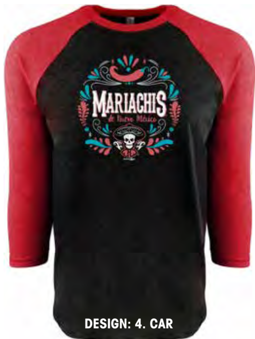
DESIGN: 4. CAR