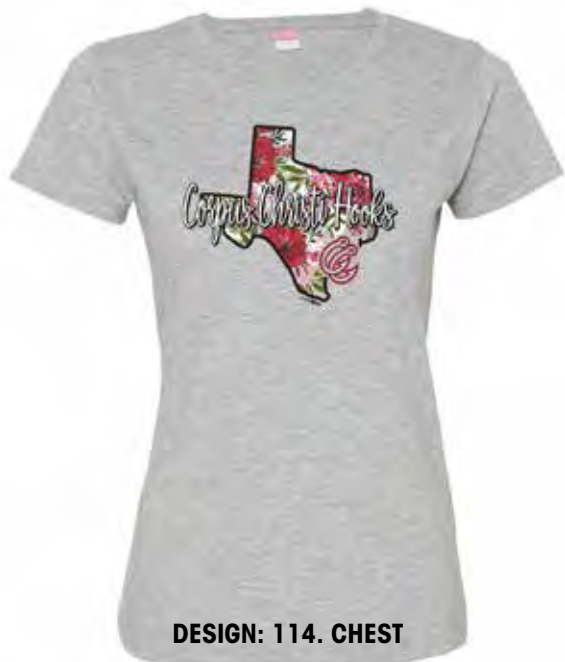
DESIGN: 114. CHEST