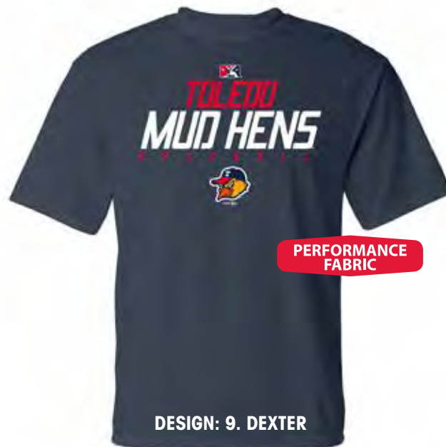
DESIGN: 9. DEXTER

COLORS: Black, Black Frost, Charcoal, Green Frost, Grey Frost, Maritime Frost, Maroon Frost, Military Green Frost, Navy, Navy Frost, Purple Frost, Red, Red Frost, Royal, Royal Frost, Turquoise Frost, White