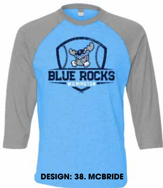
DESIGN: 38. MCBRIDE

COLORS: Sport Grey/Black, Sport Grey/Navy, Sport Grey/Red, Sport Grey/Royal, White/Black, White/Navy, White/Red, White/Royal