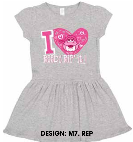
DESIGN: M7. REP

COLORS: Baby Pink, Black, Bubblegum Pink, Dark Heather Grey,