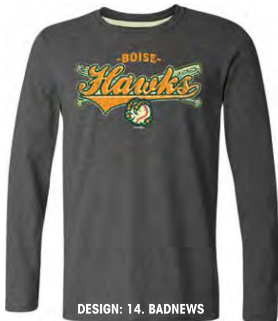
DESIGN: 14. BADNEWS