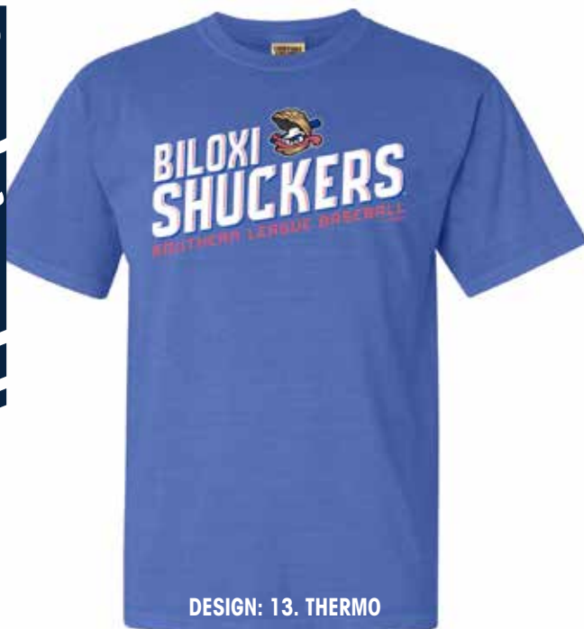
DESIGN: 13. THERMO