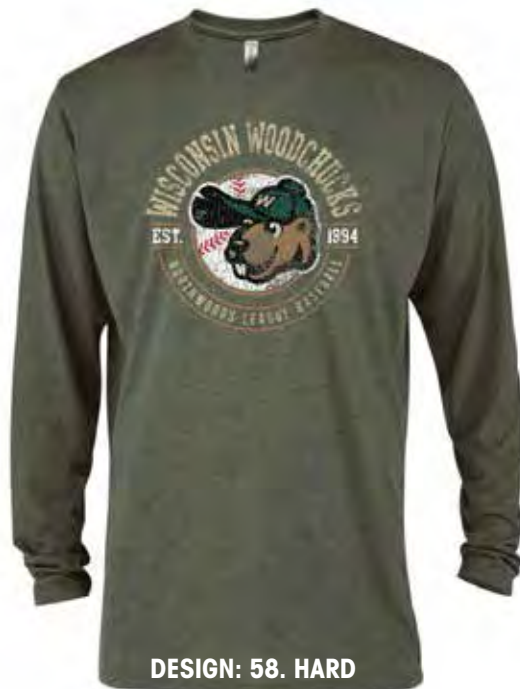
DESIGN: 58. HARD

COLORS: Granite Heather/Vintage Smoke, Natural Heather/Vintage Burgundy, Natural Heather/Granite Heather, Vintage Heather/Vintage Hot Pink, Vintage Heather/Vintage Navy, Vintage Heather/Vintage Red, Vintage Indigo/Vintage Navy, Vintage Smoke/Vintage Camo, White/Vintage Green, White/Vintage Heather, White/Vintage Hot Pink