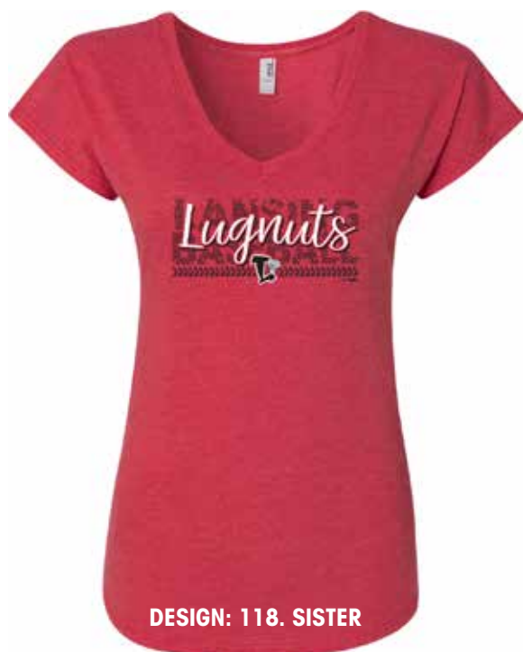
DESIGN: 118. SISTER

COLORS: Black, Charcoal, Cobalt, Garnet, Granite Heather, Heather, Hot Pink, Kelly, Lavender, Natural Heather, Navy, Orange, Pink, Purple, Raspberry, Red, Royal, White, Yellow