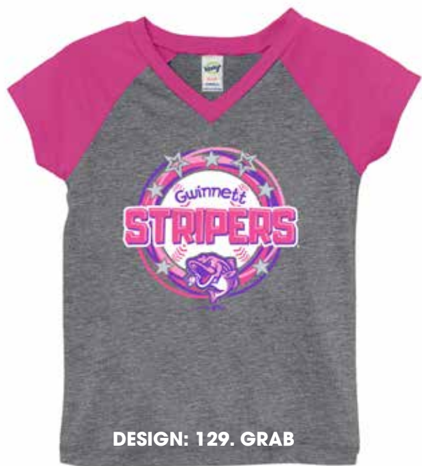
DESIGN: 129. GRAB