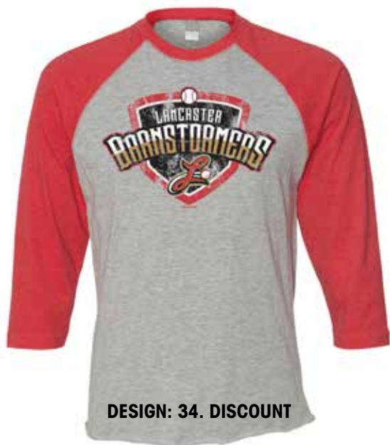
DESIGN: 34. DISCOUNT

COLORS: Aqua Tri-blend, Athletic Grey Tri-blend, Berry Tri-blend, Black Tri-blend, Blue Tri-blend, Charcoal-Black Tri-blend, Green Tri-blend, Grey Tri-blend, Maroon Tri-blend, Mint Tri-blend, Navy Tri-blend, Oatmeal Tri-blend, Orange Tri-blend, Purple Tri-blend, Red Tri-blend, Royal Tri-blend, White Fleck Tri-blend