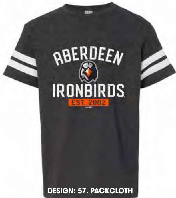
DESIGN: 57. PACKCLOTH