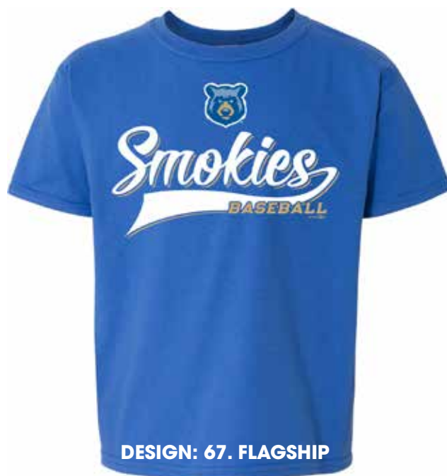
DESIGN: 67. FLAGSHIP