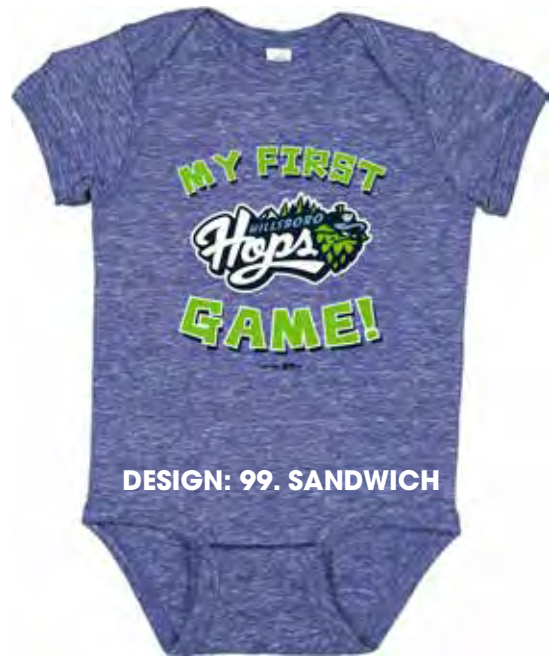
DESIGN: 99. SANDWICH

COLORS: Vintage Burgundy, Vintage Green, Vintage Hot Pink, Vintage Navy, Vintage Orange, Vintage Purple, Vintage Red, Vintage Royal, Vintage Smoke, Vintage Turquoise