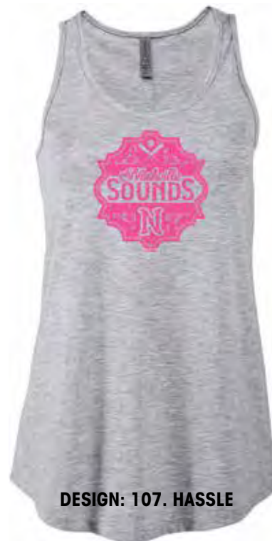
DESIGN: 107. HASSLE

COLORS: Black, Dark Grey Heather, Deep Heather, Navy, Pink, Red, Royal, White