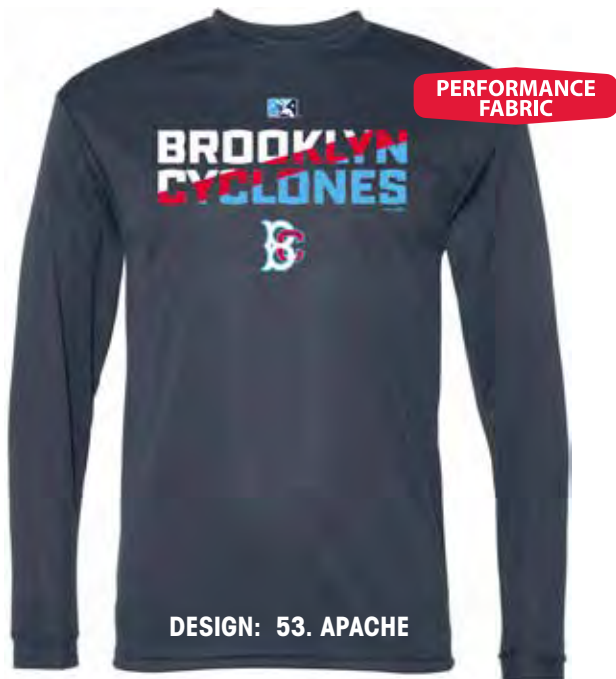
DESIGN: 53. APACHE