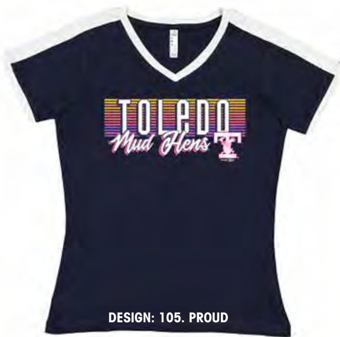
DESIGN: 105. PROUD

COLORS: Black, Heather Aubergine, Heather Caribbean Blue, Heather Dark Grey, Heather Galapagos Blue, Heather Graphite, Heather Grey, Heather Navy, Heather Orange, Heather Raspberry, Heather Red, White