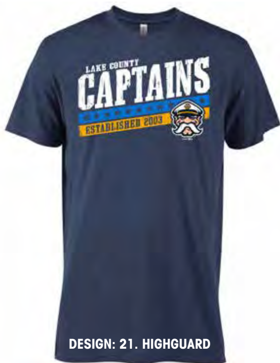
DESIGN: 21. HIGHGUARD