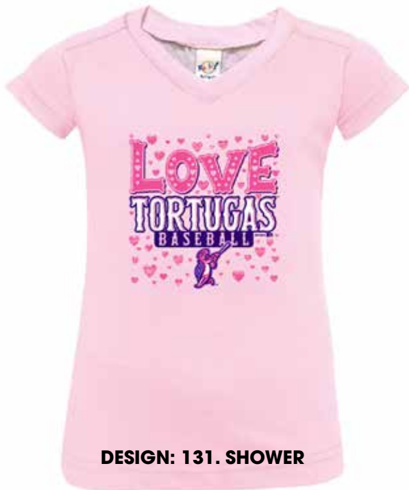
DESIGN: 131. SHOWER