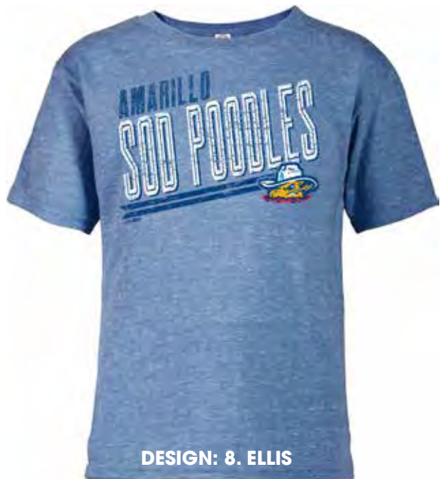
DESIGN: 8. ELLIS

COLORS: Athletic Heather, Athletic Navy, Black, Charcoal Heather, Coral Heather, Denim Heather, Kelly, Kelly Heather, Red, Red Heather, Royal, Royal Heather, Turquoise, Turquoise Heather, White