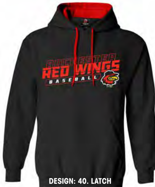
DESIGN: 40. LATCH

COLORS: Black Snow Heather, Denim Snow Heather, Graphite Snow Heather, Royal Snow Heather