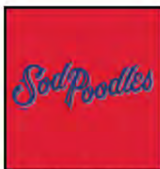
3. HOME JERSEY LETTERING