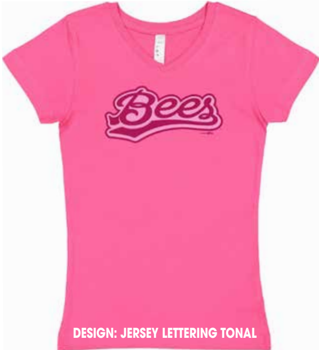
DESIGN: JERSEY LETTERING TONAL