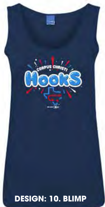
DESIGN: 10. BLIMP