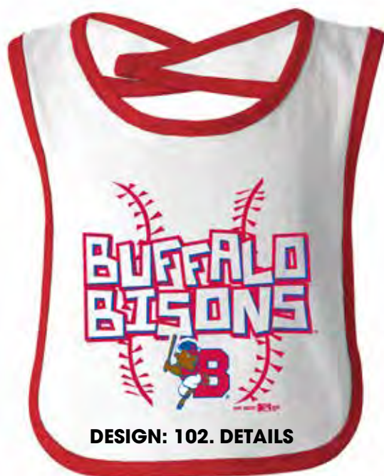
DESIGN: 102. DETAILS