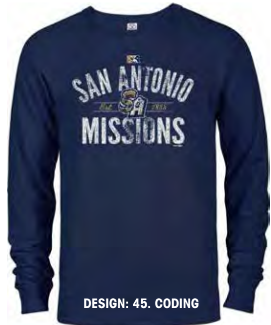
DESIGN: 45. CODING