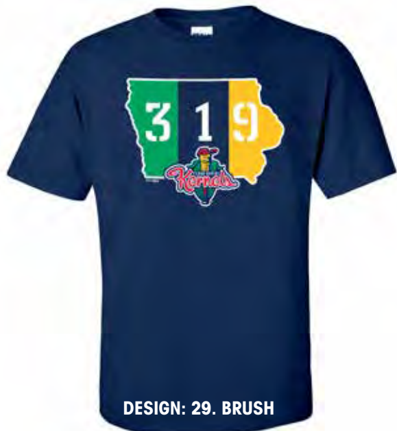
DESIGN: 29. BRUSH