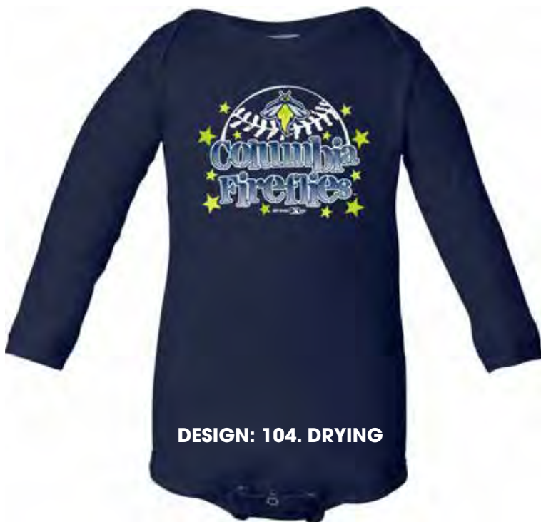
DESIGN: 104. DRYING

COLORS: Carolina Blue/Vintage Heather, Heather/Burgundy, Heather/Hot Pink, Heather/Navy, Heather/Purple, Heather/Red, Heather/Royal, Heather/Smoke, Pink/Vintage Heather, Vintage Heather/Vintage Orange, Vintage Smoke/Granite Heather, White/Vintage Heather