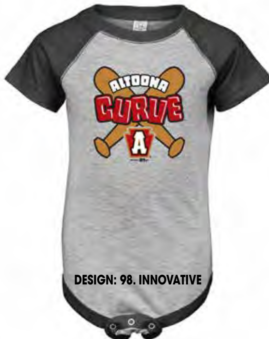
DESIGN: 98. INNOVATIVE