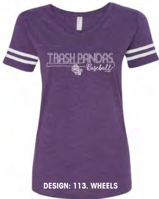
DESIGN: 113. WHEELS