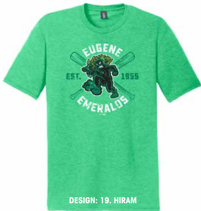
DESIGN: 19. HIRAM