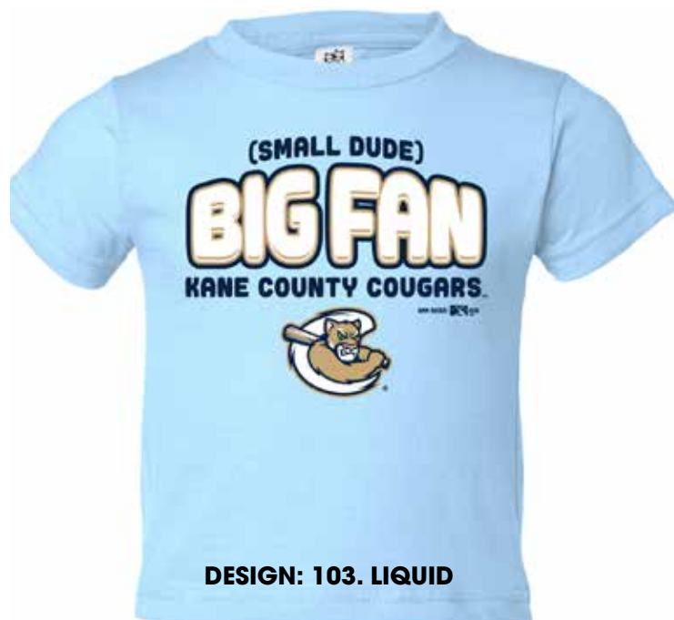
DESIGN: 103. LIQUID

COLORS: Granite Heather/Black, Heather/White, Kelly/Red, Lavender/Purple, Navy/Red, Orange/Black, Pink/Red, White/Black, White/Lt. Blue, White/Navy, White/Pink, White/Red, White/Royal