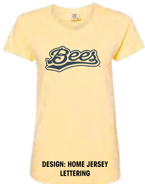
DESIGN: HOME JERSEY LETTERING