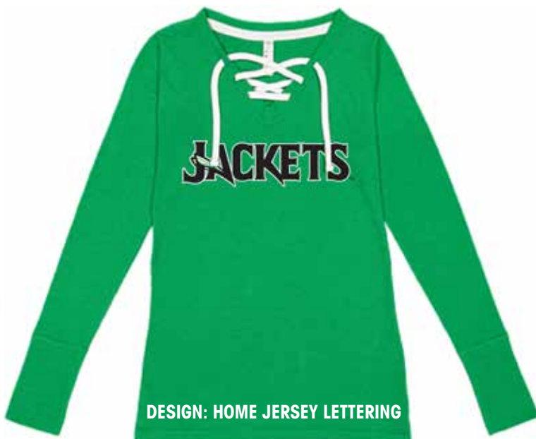
DESIGN: HOME JERSEY LETTERING

COLORS: Black, Carolina Blue, Forest Green, Garnet, Heliconia, Navy, Purple, Red, Royal, Sport Grey, White