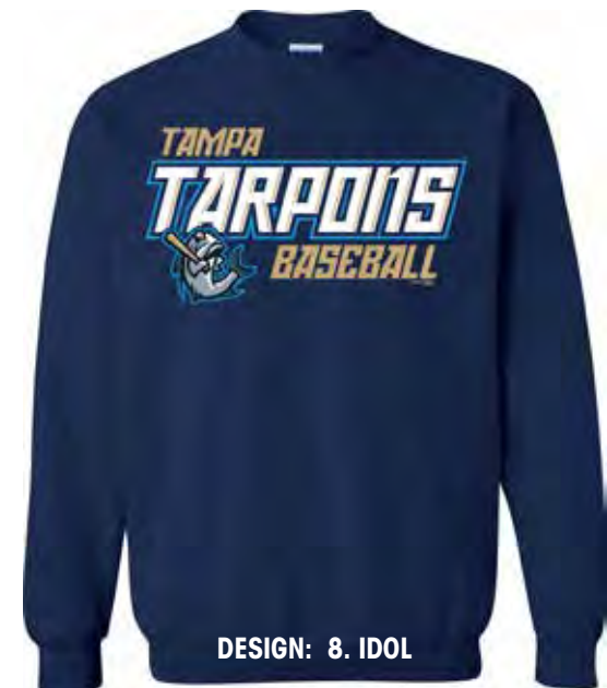
DESIGN: 8. IDOL

COLORS: Black, Blueberry, Brite Orange, Forest Green, Heathered Grey, Heathered Steel, Maroon, Navy, Red, Royal, Steel Gray, White