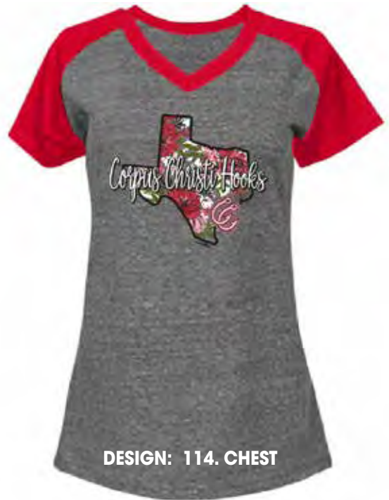
DESIGN: 114. CHEST

COLORS: Aqua, Black, Heather, Hot Pink, Key Lime, Navy, Pink, Purple, Red, White