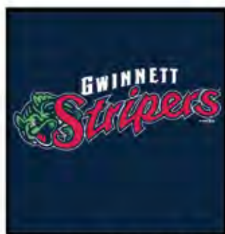
1. PRIMARY LOGO