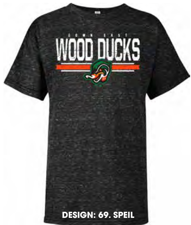
DESIGN: 69. SPEIL

COLORS: Black, Charcoal, Dark Heather Grey, Kelly Green, Midnight Navy, Orange, Purple Rush, Red, Royal Blue, Tahiti Blue, Turquoise, White