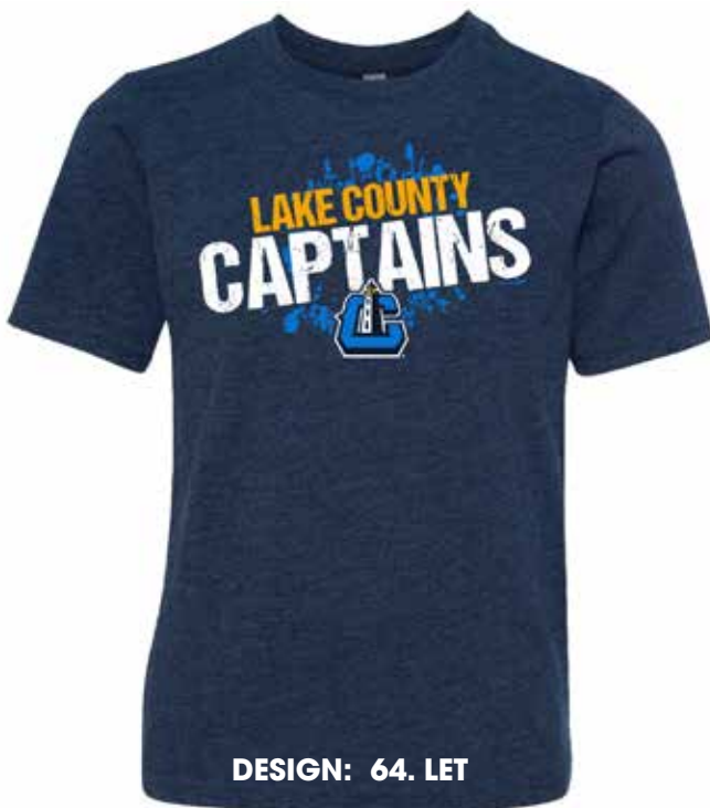
DESIGN: 64. LET

COLORS: Black Snow Heather, Denim Snow Heather, Graphite Snow Heather, Kelly Snow Heather, Purple Snow Heather, Red Snow Heather, Royal Snow Heather, Turquoise Snow Heather