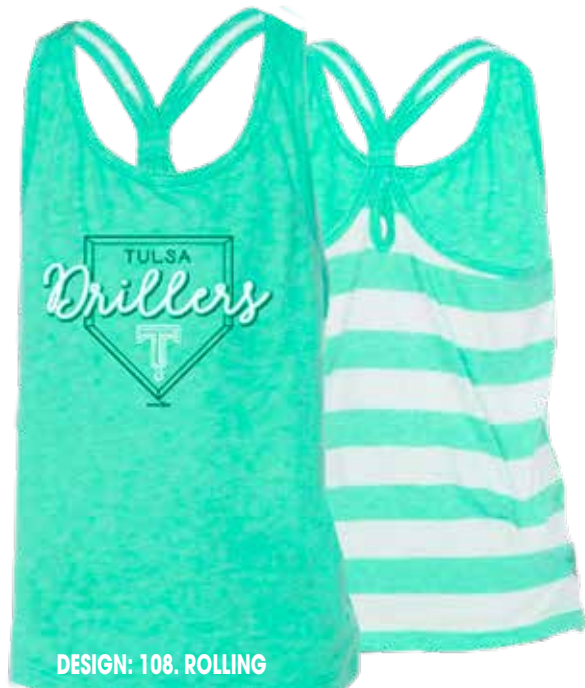
DESIGN: 108. ROLLING