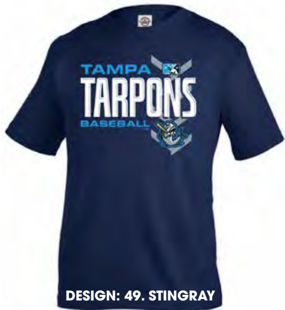
DESIGN: 49. STINGRAY