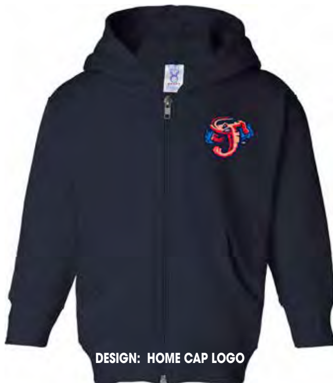
DESIGN: HOME CAP LOGO