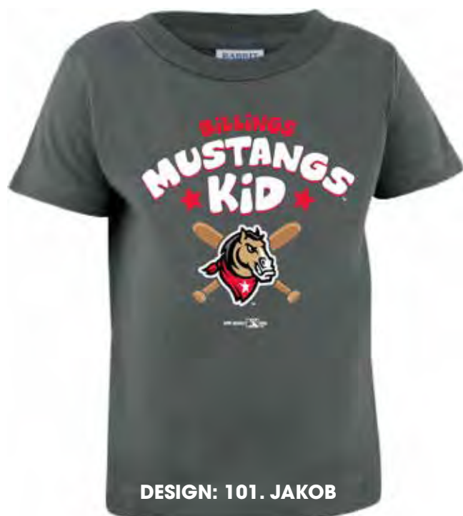
DESIGN: 101. JAKOB

COLORS: Ash, Azalea, Black, Cherry Blossom, Forest Green, Garnet, Gold, Lt. Blue, Maroon, Navy, Orange, Oxford, Pink, Purple, Red, Royal, White