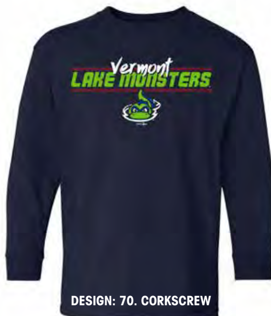
DESIGN: 70. CORKSCREW

COLORS: Heather/Envy, Heather/Vintage Black, Heather/Vintage Navy, Heather/Vintage Red, Heather/Vintage Royal, Heather White/Envy, Heather White/Heather, Heather White/Vintage Black, Heather White/Vintage Pink, Heather White/Vintage Purple, Heather White/Vintage Red, Heather White/Vintage Royal, Vintage Black/Heather, Vintage Black/Vintage Red