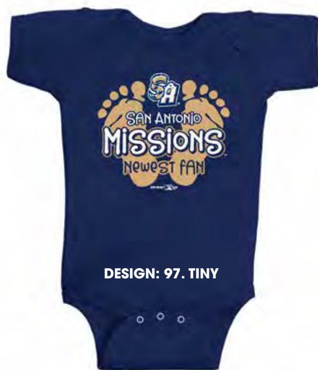
DESIGN: 97. TINY

COLORS: Ash, Black, Carolina Blue, Charcoal, Forest, Gold, Heather, Hot Pink, Kelly, Key Lime, Lavender, Lt. Blue, Maroon, Navy, Orange, Pink, Purple, Raspberry, Red, Royal, White