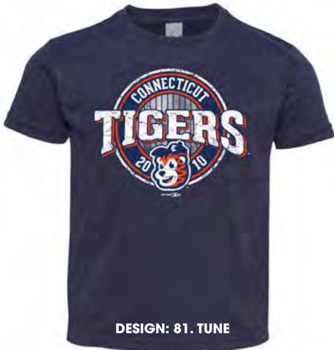
DESIGN: 81. TUNE

COLORS: Apple, Ash, Black, Carolina Blue, Charcoal, Cobalt, Forest, Garnet, Gold, Heather, Hot Pink, Kelly, Key Lime, Lavender, Lt. Blue, Maroon, Navy, Orange, Pink, Purple, Raspberry, Red, Royal, Texas Orange, Turquoise, White