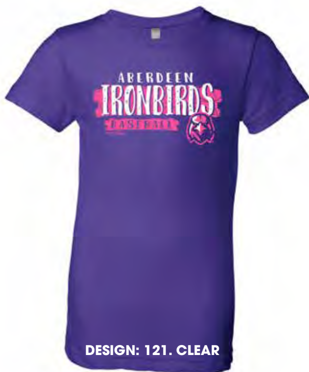
DESIGN: 121. CLEAR

COLORS: BODY/STRIPES: Heather Black/Black, Heather Flamingo/White, Heather Ice Green/White, Heather Pink Flash/White, Heather Purple/Purple, Heather Titanium/Titanium