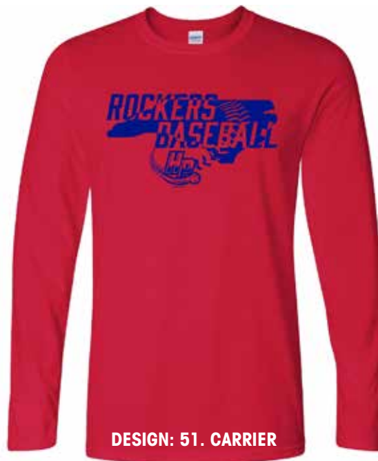
DESIGN: 51. CARRIER