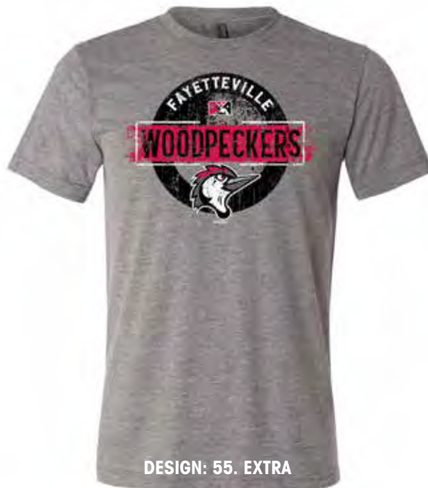
DESIGN: 55. EXTRA

COLORS: Black, Blossom, Blue Jean, Brick, Butter, Chalky Mint, Chili, Citrus, Crimson, Denim, Flo Blue, Grape, Graphite, Grass, Grey, Heliconia, Kiwi, Lagoon Blue, Melon, Neon Pink, Pepper, Periwinkle, Red, Seafoam, True Navy, Watermelon, White, Yam