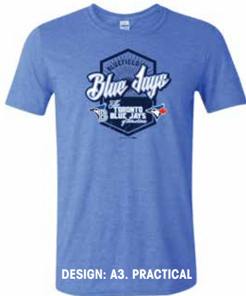
DESIGN: A3. PRACTICAL

COLORS: Antique Cherry Red, Black, Cardinal, Carolina Blue, Charcoal, Daisy, Dark Heather, Forest, Gold, Heather Cardinal, Heather Indigo, Heather Navy, Heather Sapphire, Heliconia, Indigo Blue, Irish Green, Kelly, Light Blue, Light Pink, Lime, Maroon, Natural, Navy, Orange, Purple, Red, Royal, Safety Orange, Safety Pink, Sport Grey, Texas Orange, White