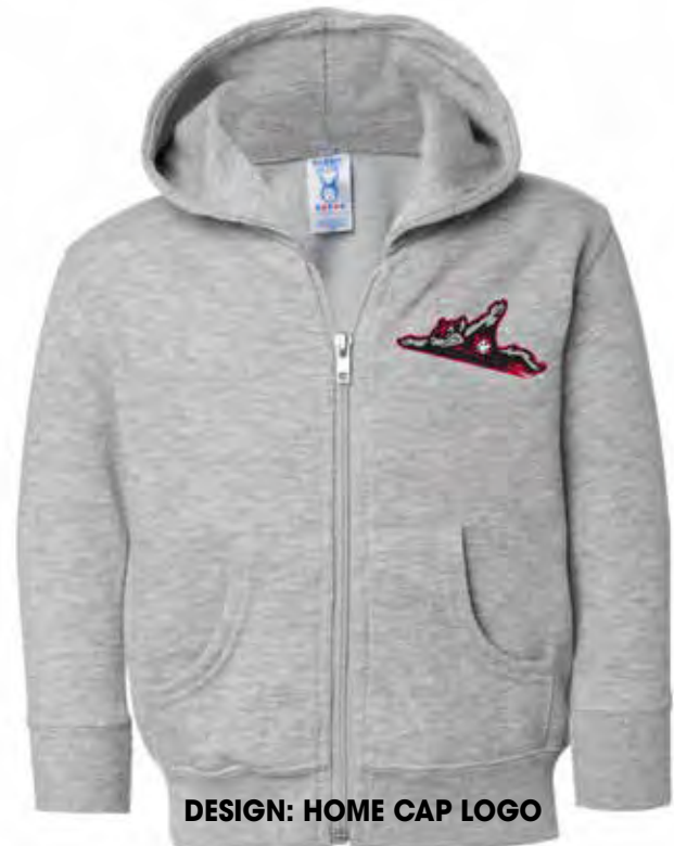
DESIGN: HOME CAP LOGO

COLORS: Black, Heather, Navy, Pink, Red, Royal, White