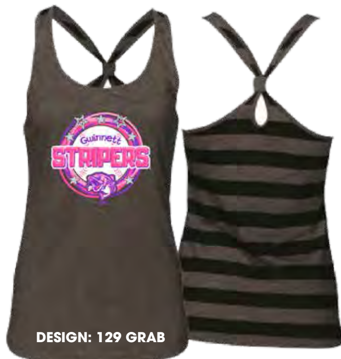
DESIGN: 129 GRAB

COLORS: Black, Cobalt, Heather, Navy, Purple, Red, Royal, White