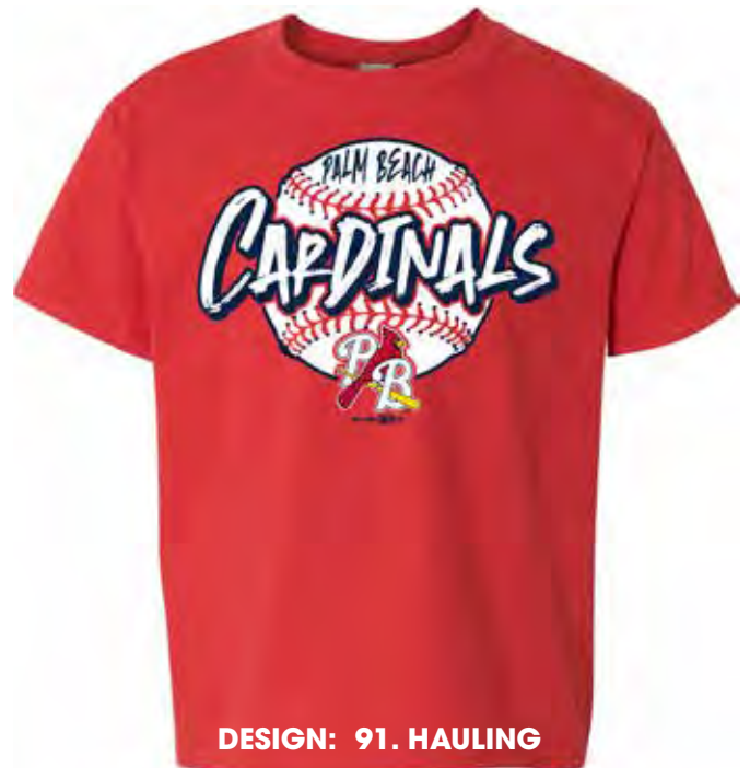
DESIGN: 91. HAULING

COLORS: Vintage Burgundy, Vintage Green, Vintage Hot Pink, Vintage Navy, Vintage Orange, Vintage Purple, Vintage Red, Vintage Royal, Vintage Smoke, Vintage Turquoise