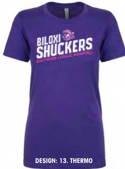
DESIGN: 13. THERMO

COLORS: Banana Cream, Black, Cancun, Dark Grey, Heather Grey, Hot Pink, Indigo, Kelly, Light Orange, Lilac, Midnight Navy, Military Green, Mint, Purple Rush, Raspberry, Red, Royal, Scarlet, Silver, Tahiti Blue, Turquoise, White