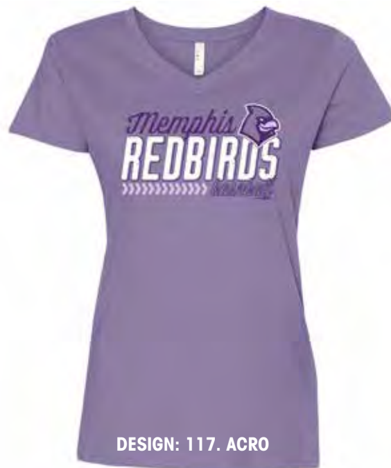
DESIGN: 117. ACRO

COLORS: Butter, Chalky Mint, Flo Blue, Lagoon Blue, Seafoam, Violet, Watermelon, White