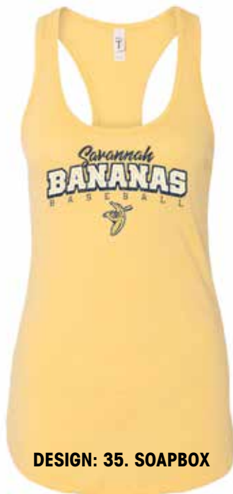
DESIGN: 35. SOAPBOX