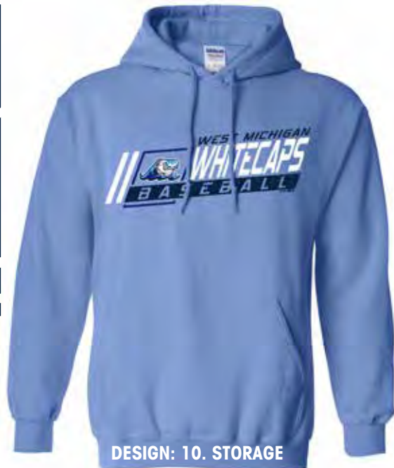
DESIGN: 10. STORAGE