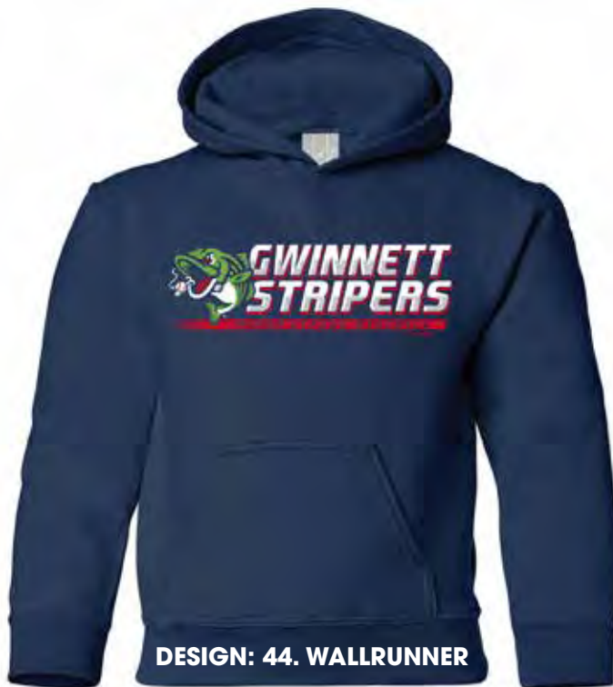
DESIGN: 44. WALLRUNNER

COLORS: Black, Dark Heather, Forest Green, Graphite Heather, Maroon, Navy, Red, Royal, Safety Pink, Sport Grey, White