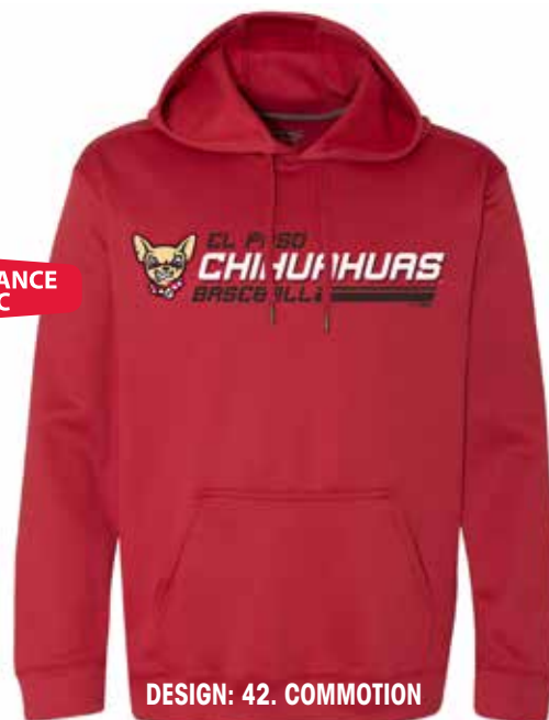
DESIGN: 42. COMMOTION