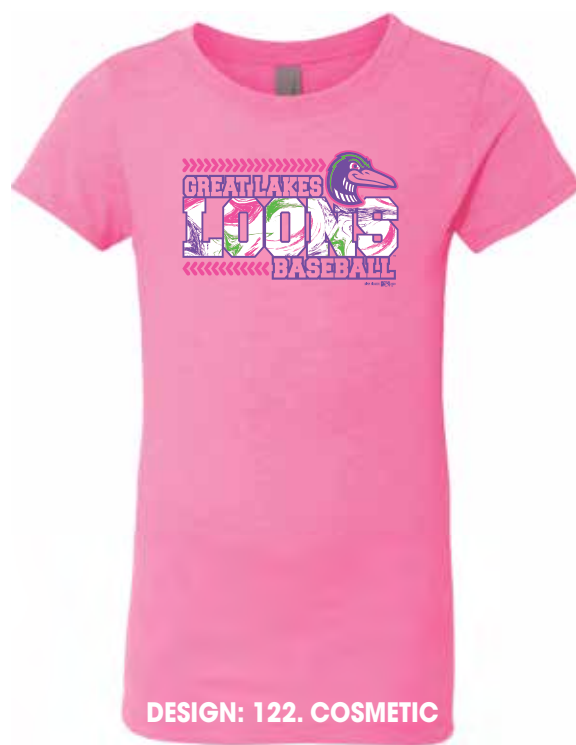
DESIGN: 122. COSMETIC

COLORS: Black, Heather Grey (90/10), Hot Pink, Lilac, Lt. Pink, Midnight Navy, Purple Rush, Raspberry, Red, Tahiti Blue, Turquoise, White