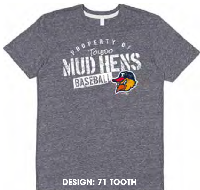
DESIGN: 71 TOOTH

COLORS: Black, Charcoal, Daisy, Dark Heather, Graphite Heather, Heather Cardinal, Heather Irish Green, Heather Navy, Heather Orange, Heather Purple, Heather Red, Heather Royal, Heather Sapphire, Heliconia, Lime, Navy, Red, Royal, Sapphire, Sport Grey, White