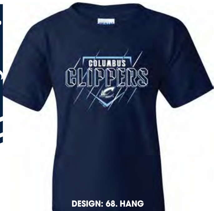
DESIGN: 68. HANG