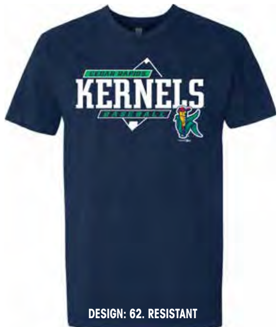
DESIGN: 62. RESISTANT