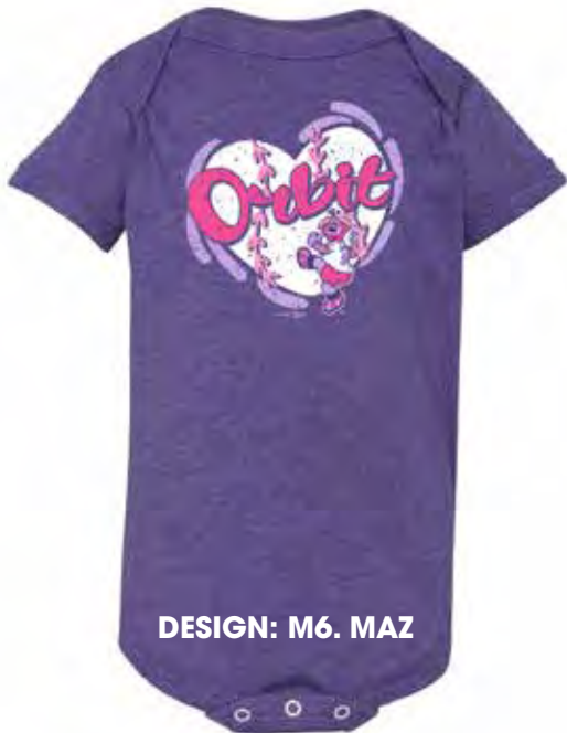
DESIGN: M6. MAZ