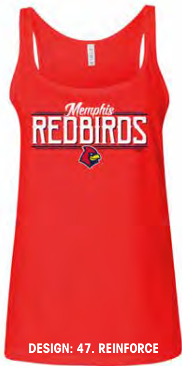
DESIGN: 47. REINFORCE