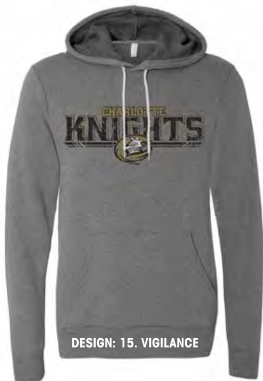
DESIGN: 15. VIGILANCE