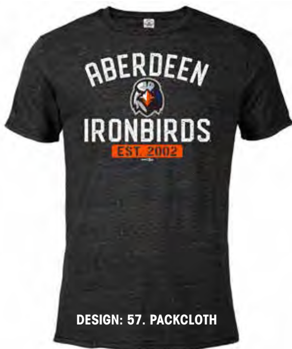
DESIGN: 57. PACKCLOTH

COLORS: Caribbean Melange, Gray Melange, Mauvelous Melange, Military Green Melange, Navy Melange, Papaya Melange, Purple Melange, Red Melange, Royal Melange, Smoke Melange