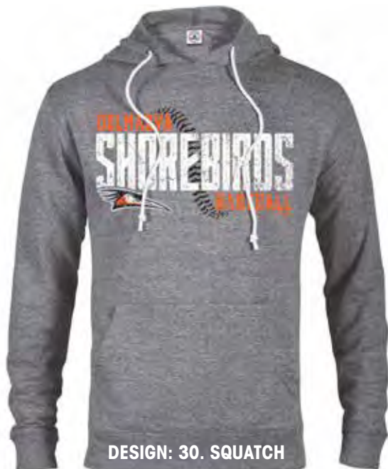
DESIGN: 30. SQUATCH

COLORS: Black, Charcoal Heather, Denim Heather, Graphite Heather, Heliconia Heather, Kelly Heather, Navy, Oatmeal Heather, Purple Heather, Red Heather, Royal Heather