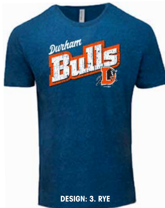
DESIGN: 3. RYE

COLORS: Athletic Heather, Athletic Navy Heather, Black Heather, Charcoal Heather, Maroon Heather, Moss Heather, Oatmeal Heather, Steel Quartz