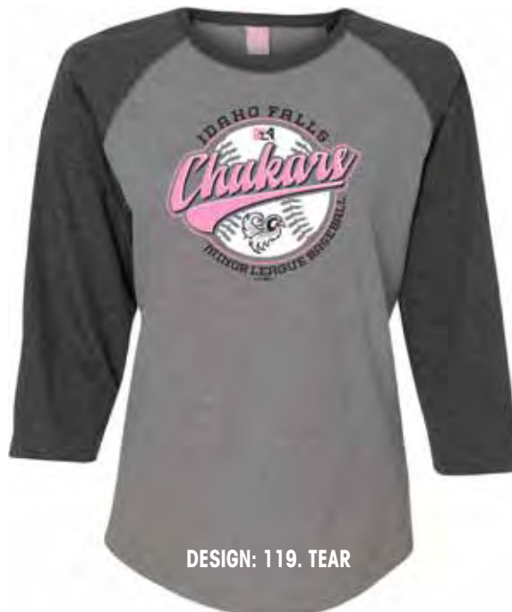
DESIGN: 119. TEAR

COLORS: Hot Pink/White/Black, Navy/Titanium/White, Red/Titanium/White, Royal/Titanium/White, Titanium/Black/White, White/Titanium/Black