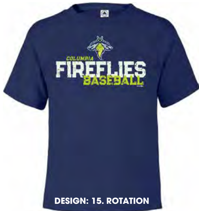
DESIGN: 15. ROTATION

COLORS: Athletic Heather, Berry, Black, Charcoal, Charcoal Heather, Deep Coral, Denim Heather, Graphite Heather, Heliconia Heather, Kelly, Kelly Heather, Lavender, Navy, Orange, Purple, Purple Heather, Red, Red Heather, Royal, Royal Heather, Safety Green, Safety Orange, Safety Pink, Sky Blue, Turquoise, Turquoise Heather, White