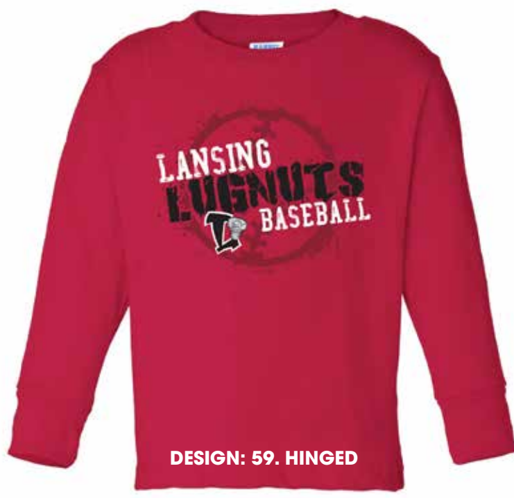
DESIGN: 59. HINGED

COLORS: Carolina Blue/Vintage Heather, Pink/Vintage Heather, Vintage Heather/Vintage Burgundy, Vintage Heather/Vintage Hot Pink, Vintage Heather/Vintage Navy, Vintage Heather/Vintage Orange, Vintage Heather/Vintage Purple, Vintage Heather/Vintage Red, Vintage Heather/Vintage Royal, Vintage Heather/Vintage Smoke, Vintage Smoke/Granite Heather, White/Vintage Heather