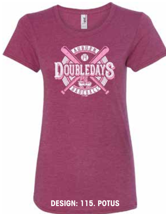
DESIGN: 115. POTUS

COLORS: Black, Burnt Orange, Columbia Blue, Electric Blue, Forest, Gold, Graphite, Hot Coral, Hot Pink, Kelly, Lime, Maroon, Navy, Pink, Purple, Red, Royal, Safety Orange, Safety Yellow, Silver, Vegas Gold, White