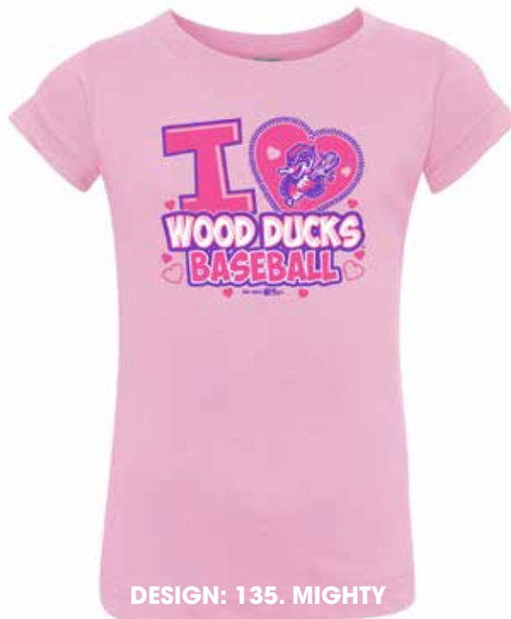
DESIGN: 135. MIGHTY

COLORS: BODY/STRIPES: Heather Black/Black, Heather Ice Green/White, Heather Navy/Navy