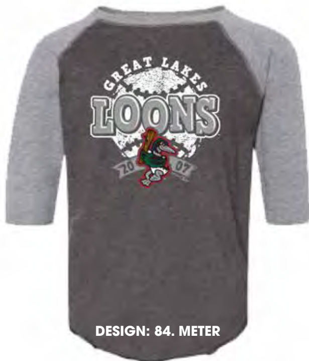
DESIGN: 84. METER

COLORS: Vintage Burgundy, Vintage Green, Vintage Heather, Vintage Hot Pink, Vintage Navy, Vintage Orange, Vintage Purple, Vintage Red, Vintage Royal, Vintage Smoke, all with Blended White stripes