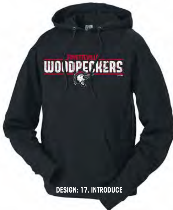
DESIGN: 17. INTRODUCE

COLORS: Antique Cherry Red, Antique Sapphire, Ash, Black, Cardinal Red, Carolina Blue, Charcoal, Cherry Red, Dark Heather, Forest, Garnet, Gold, Graphite Heather, Heather Dark Green, Heather Dark Maroon, Heather Dark Navy, Heather Royal, Heather Scarlet, Heliconia, Indigo Blue, Irish Green, Light Blue, Light Pink, Maroon, Military Green, Navy, Orange, Purple, Red, Royal, Safety Green, Safety Orange, Safety Pink, Sapphire, Sport Gray, White