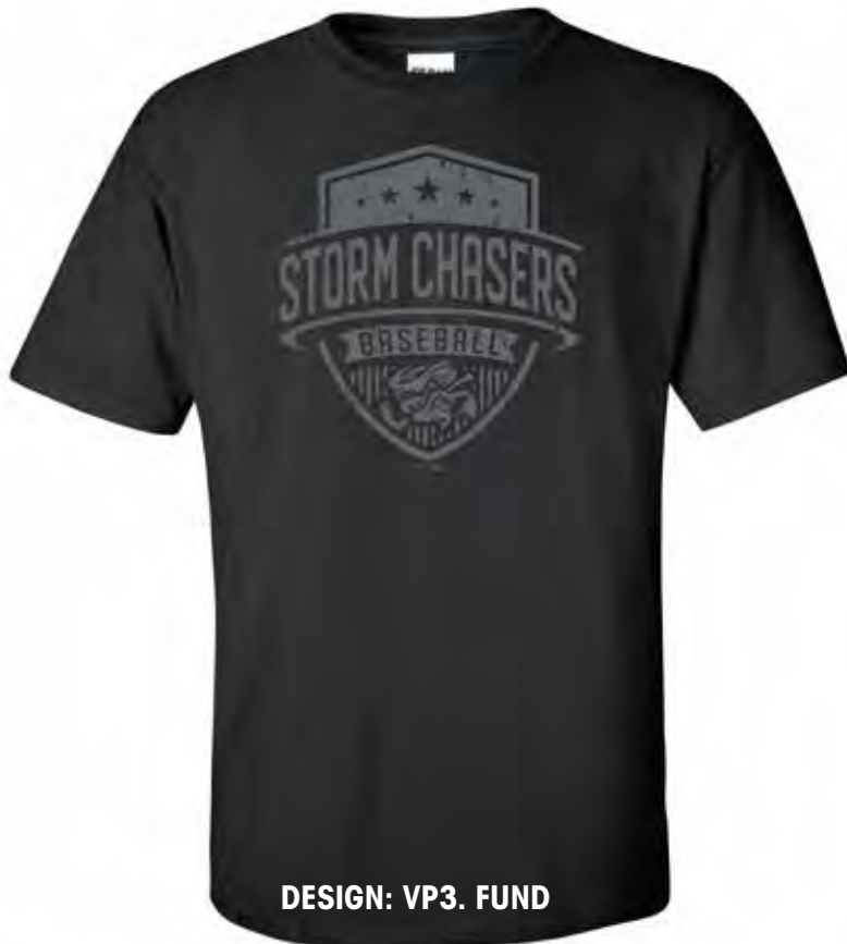
DESIGN: VP3. FUND