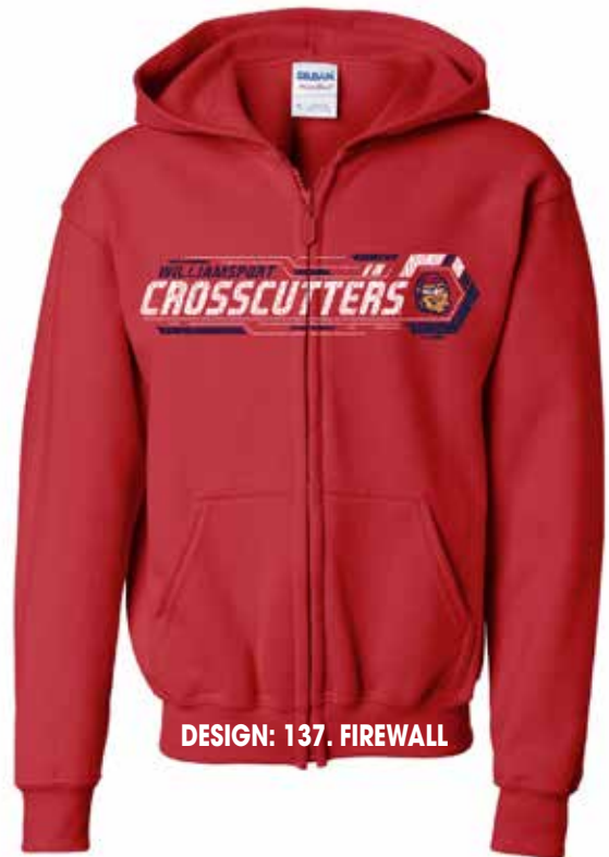
DESIGN: 137. FIREWALL

COLORS: Black, Heather, Kelly, Navy, Orange, Pink, Purple, Raspberry, Red, Royal, Vintage Hot Pink, Vintage Red, Vintage Royal, Vintage Smoke, White