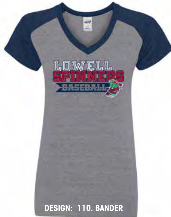
DESIGN: 110. BANDER

COLORS: Granite Heather/Vintage Smoke, Vintage Burgundy, Vintage Green, Vintage Heather, Vintage Hot Pink, Vintage Navy, Vintage Orange, Vintage Purple, Vintage Red, Vintage Royal, Vintage Smoke with Blended White stripes