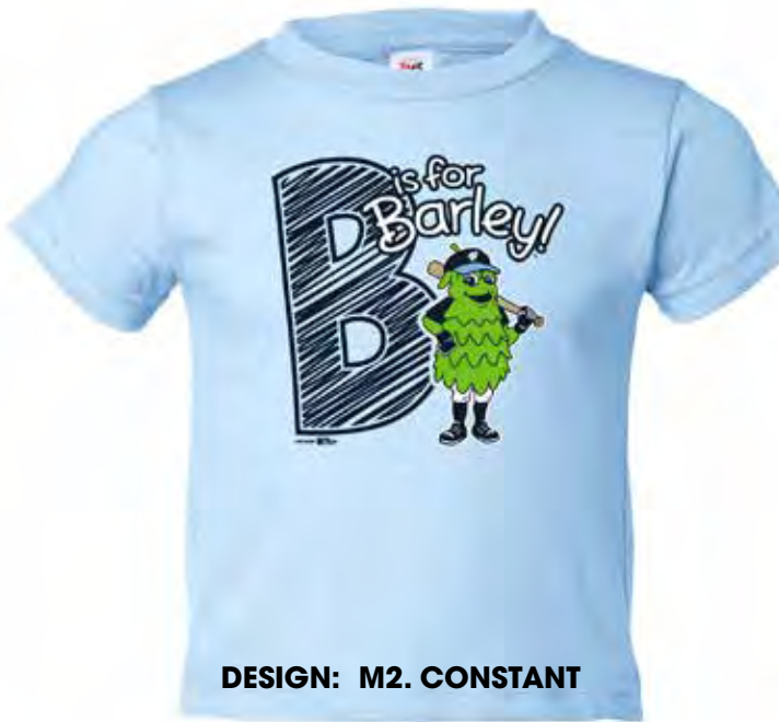
DESIGN: M2. CONSTANT