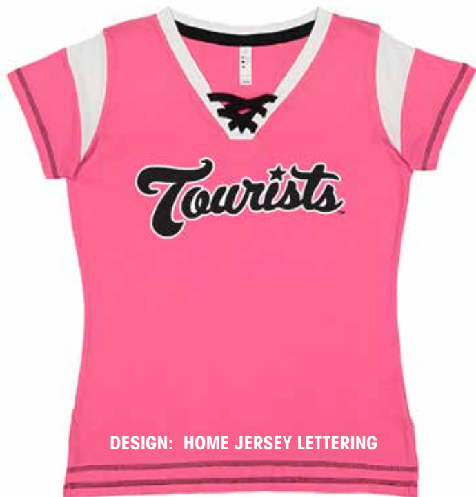
DESIGN: HOME JERSEY LETTERING

COLORS: Dark Heather Grey body with Black, Cobalt Blue, Grape, Island Blue, Navy, or Red sleeves