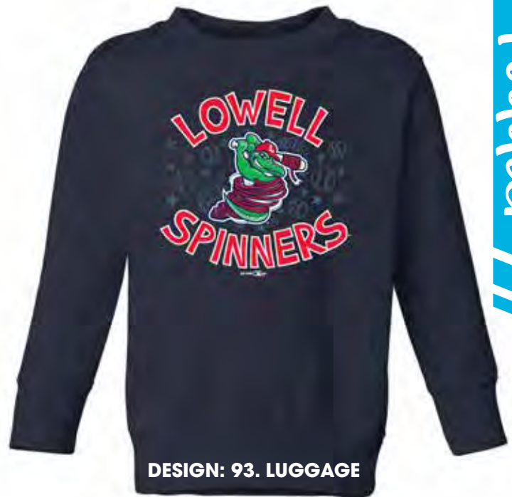
DESIGN: 93. LUGGAGE

COLORS: Black, Heather, Kelly, Navy, Orange, Pink, Purple, Raspberry, Red, Royal, Turquoise, Vintage Hot Pink, Vintage Red, Vintage Royal, Vintage Smoke, White