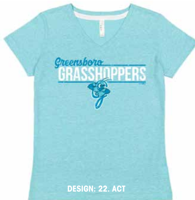
DESIGN: 22. ACT

COLORS: Black, Carolina Blue, Forest, Fuchsia, Gold, Granite Heather, Heather, Hot Pink, Kelly, Lt. Blue, Navy, Orange, Pink, Purple, Raspberry, Red, Royal, Vintage Burgundy, Vintage Green, Vintage Hot Pink, Vintage Navy, Vintage Orange, Vintage Purple, Vintage Red, Vintage Royal, Vintage Smoke, Vintage Turquoise, White