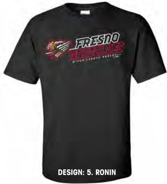
DESIGN: 5. RONIN

COLORS: Antique Cherry Red, Antique Irish Green, Azalea, Berry, Black, Cardinal, Carolina Blue, Charcoal, Coral Silk, Daisy, Dark Heather, Electric Green, Forest, Garnet, Gold, Graphite Heather, Gravel, Heather Navy, Heather Red, Heather Sapphire, Heliconia, Ice Grey, Indigo Blue, Irish Green, Lime, Lt. Blue, Lt. Pink, Maroon, Military Green, Mint Green, Navy, Neon Blue, Neon Green, Orange, Purple, Red, Royal, Safety Orange, Safety Pink, Sapphire, Sky, Sport Grey, Texas Orange, Turf Green, White, Yellow Haze