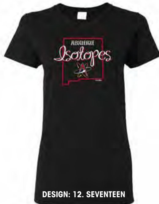
DESIGN: 12. SEVENTEEN

COLORS: Athletic Heather, Berry Heather, Black Heather, Charcoal Heather, Jade Heather, Navy Heather, Oatmeal Heather, Steel Quartz