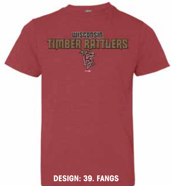
DESIGN: 39. FANGS

COLORS: Black, Carolina Blue, Charcoal, Daisy, Dark Heather, Electric Green, Gold, Graphite Heather, Heather Cardinal, Heather Forest, Heather Indigo, Heather Irish Green, Heather Military Green, Heather Navy, Heather Orange, Heather Purple, Heather Red, Heather Royal, Heather Sapphire, Irish Green, Light Blue, Navy, Orange, Purple, Red, Royal, Sport Grey, White