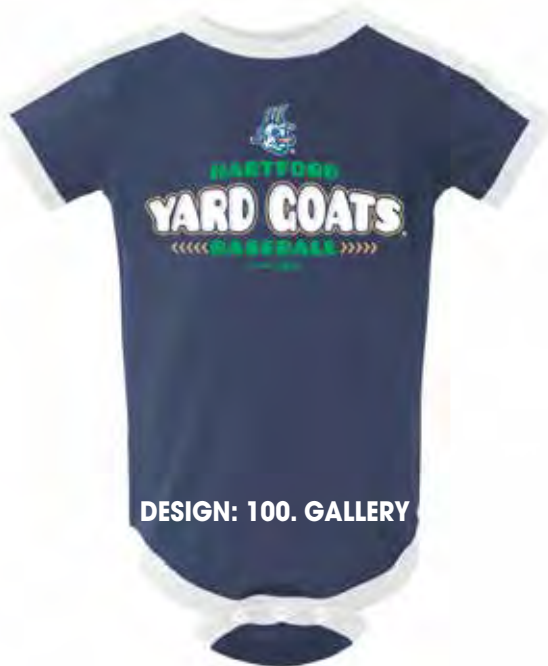
DESIGN: 100. GALLERY