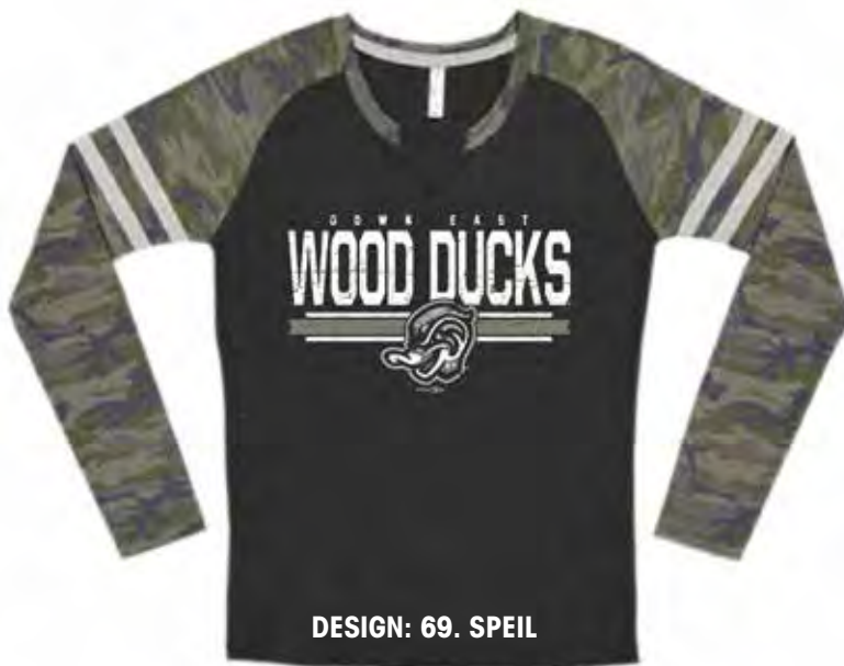
DESIGN: 69. SPEIL

COLORS: Natural/Titanium, Vintage Green/White, Vintage Heather/White, Vintage Navy/White, Vintage Purple/White, Vintage Red/White, Vintage Royal/White, Vintage Smoke/Black, White/Titanium