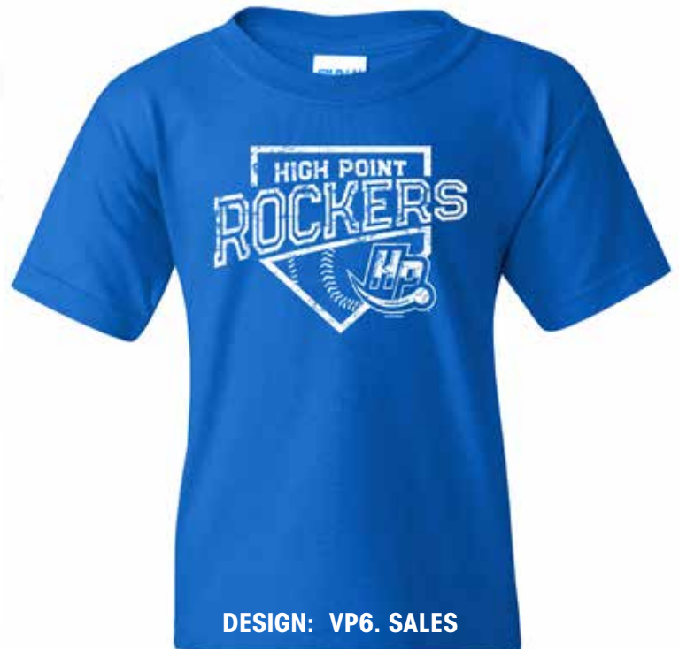
DESIGN: VP6. SALES