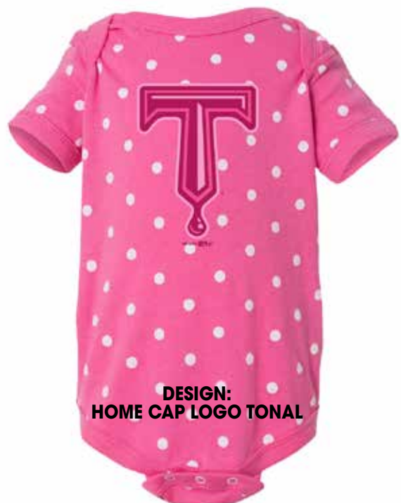
DESIGN: HOME CAP LOGO TONAL

COLORS WITH WHITE POLKA DOTS: Red/White Dot, Raspberry/White Dot